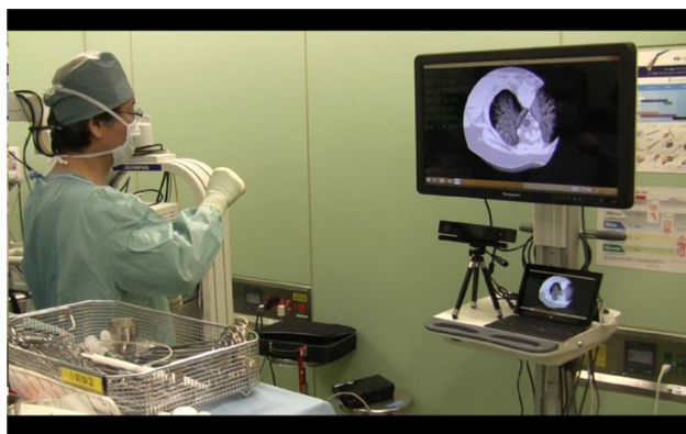
Fig. 1 Operator manipulating the model

To implement the Opect 3D, Kinect for Windows v2 sensor (Microsoft Corporation) was utilized and three-dimensional models were constructed with uncompressed DICOM files through three-dimensional volume rendering. Because Kinect for Windows v2 sensor has a built-in high resolution infrared and RGB camera and is capable to identify shapes of our hands (rock, paper, and scissors) precisely, these shapes were assigned to the function of three-dimensional model manipulations. The model was rotated by the rock, stopped by the paper, parallel translated by the scissors shaped hand's motion, and enlarged/reduced by closing a hand to the Kinect. Operators were able to manipulate the model with their single hand as shown in Fig. 1.