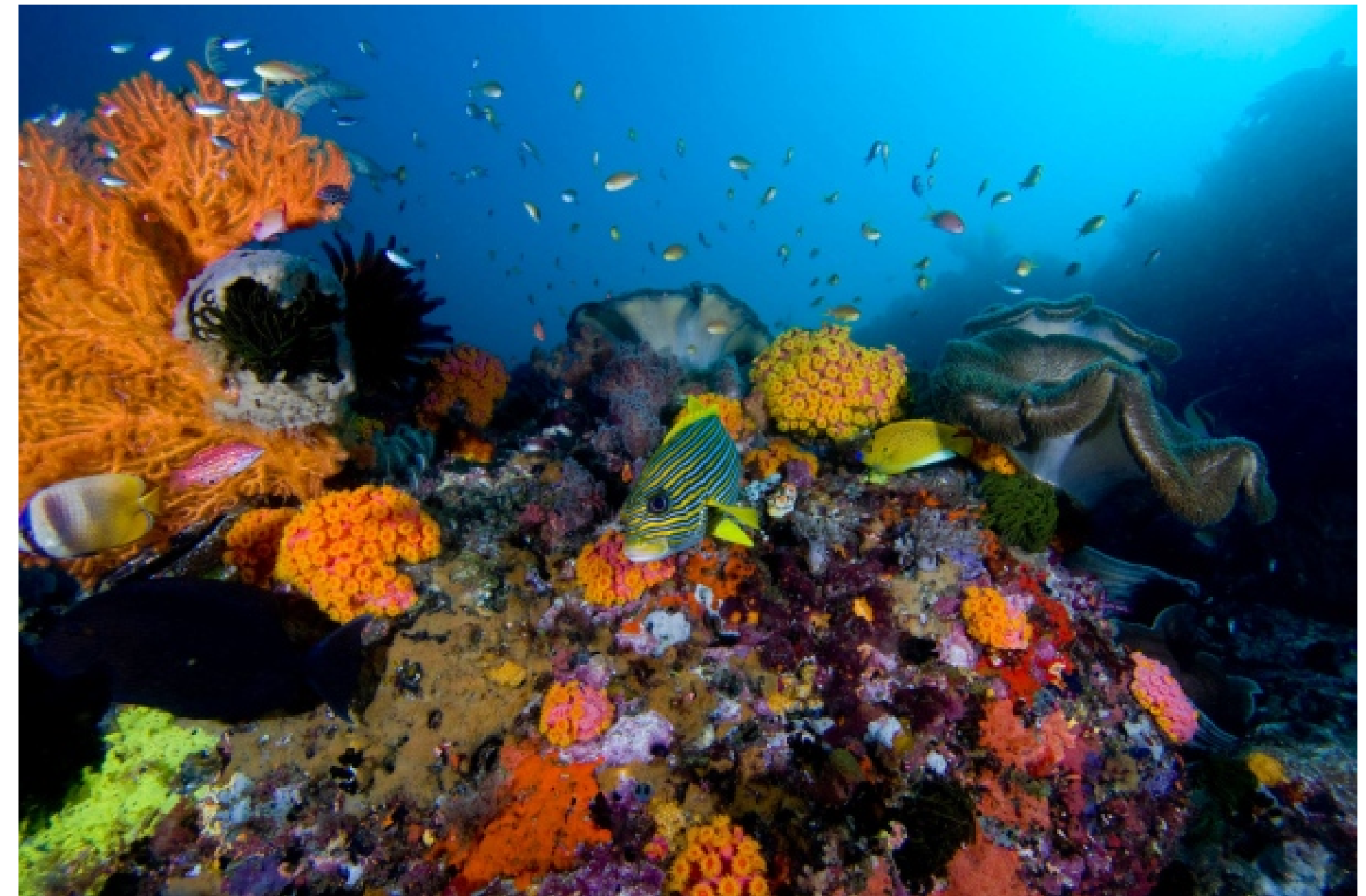
Healthy coral reef community, East Timor

As recognized by the Convention on Biological Diversity signed at the 1992 Rio Earth Summit, biological diversity is about more than plants, animals and micro-organisms and their ecosystems – it is about people and our need for food security, medicines, fresh air and water, shelter, and a clean and healthy environment in which to live. Yet the loss of biodiversity through the extinction of species, in which habitat destruction and fragmentation due to land-use changes play a key role, continues at an alarming rate.