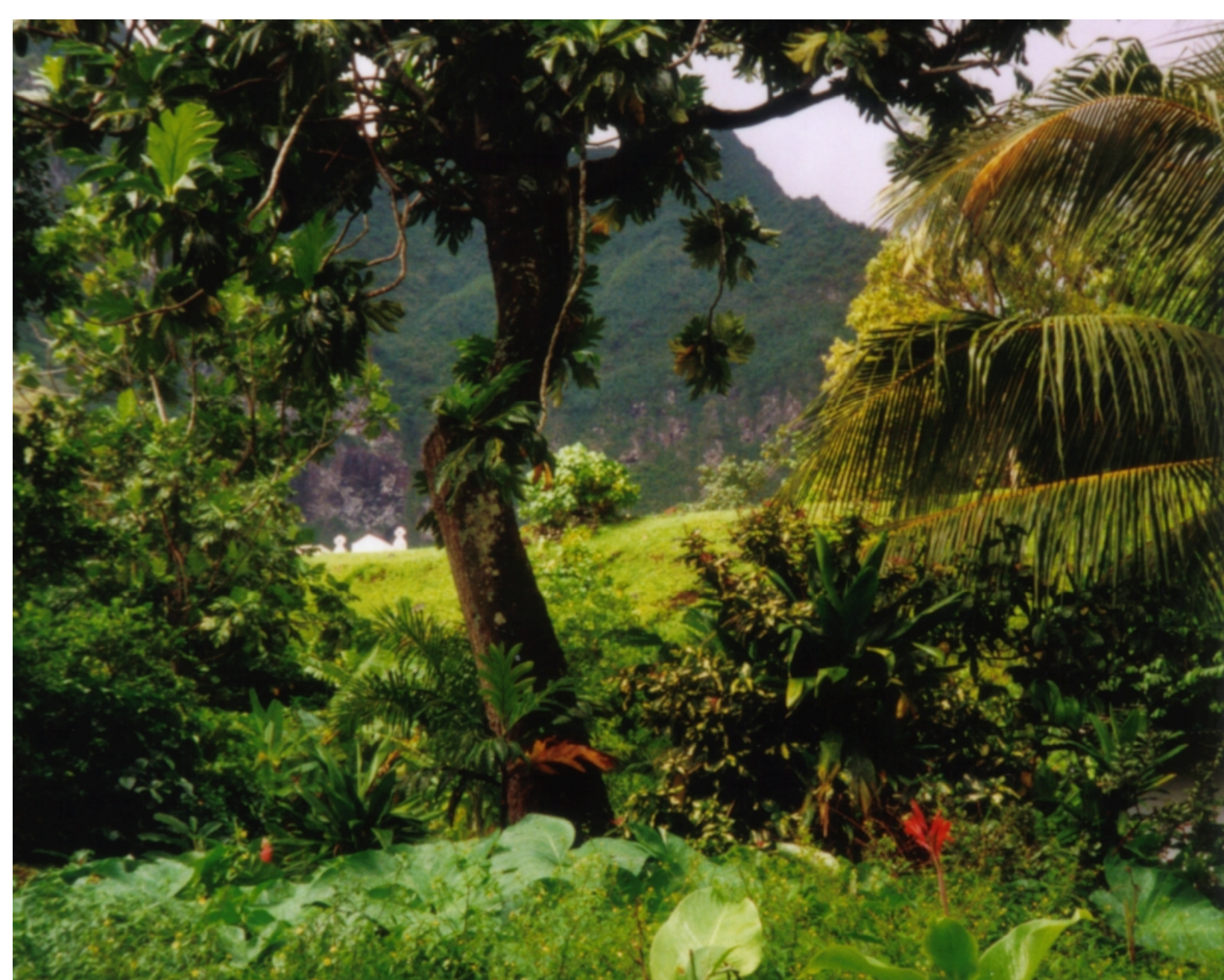
Rain forest, Fatu Hiva Island, French Polynesia