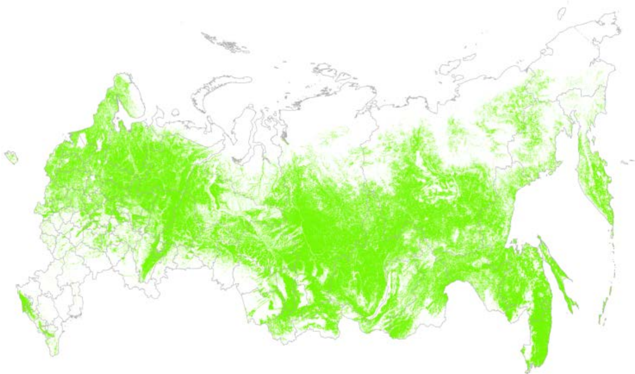
Fig. 2. Hybrid forest/non-forest map of Russian forests is available for browsing and download in full resolution (230 m) at: http://Russia.geo-wiki.org

The lower estimates of forest area in the Asian area is very likely due to natural and anthropogenic disturbances, mainly wildfire, biogenic (insects/diseases) factors and industrial development. About 2.5 million hectares of forest a year have been lost to wildfires over the past