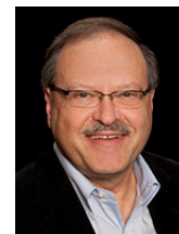
Insight from Arthur Weiss

Human immune deficiencies often reveal unexpected functions or highlight differences between human and mouse immune systems. In this issue, Keller et al. describe a family with three children that are homozygous for LAT mutations leading to premature LAT truncation, eliminating all of its known tyrosine phosphorylation sites.