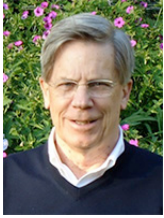
Insight from Douglas Fearon

In this issue, Chapuis et al. describe the response of a single patient with metastatic melanoma to combination immunotherapy with anti-CTLA4 and adoptive T cell therapy (1). Although JEM usually discourages the submission of single case studies, the editors, like the authors, realized that this patient was unusual. He had previously been treated with anti-CTLA4 and adoptive T cell therapy administered as monotherapies, with only possible slowing of tumor growth with the former, and no response to the latter. The subsequent complete and durable clinical response to simultaneous treatment with these two modalities, therefore, allowed an argument to be made that their combination was responsible for the improved outcome.