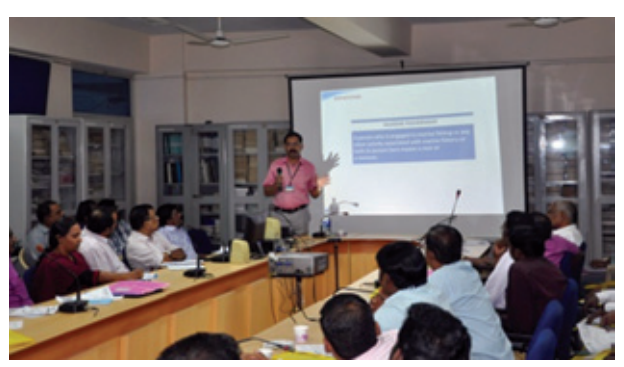
Fig. 4. Workshop at Chennai

The involvement of correct supervision is very essential to finish the entire census within the decided time frame. The various levels of supervisors were identified from both scientific and technical staff of the institute including Field Level Supervisors (Technical staff), District Level Supervisors (Scientists), State Co-ordinators (Scientist-in-charge of Regional/Research Centres), Regional Co-ordinators (Scientists of Fishery Resources Assessment Division), Project Leader (Head, Fishery Resources Assessment Division) and National Co-ordinator (Director, ICAR-CMFRI).