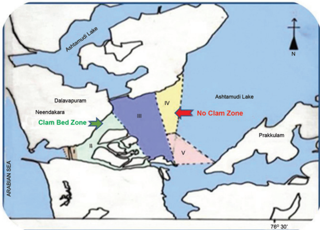
Fig . 1. Map of Ashtamudi Lake showing sampling zones

As part of eco-labelling the scientifically managed clam fisheries of Ashtamudi Lake, the ICAR-Central Marine Fisheries Research Institute (CMFRI) in collaboration with World Wide Fund for Nature (WWF) probed the ecosystem benefits coming out of the management initiatives. Under the clam management programme, the stock status of clams of Ashtamudi Lake is assessed every year. Five zones were identified (Mohamed et al. , 2013).