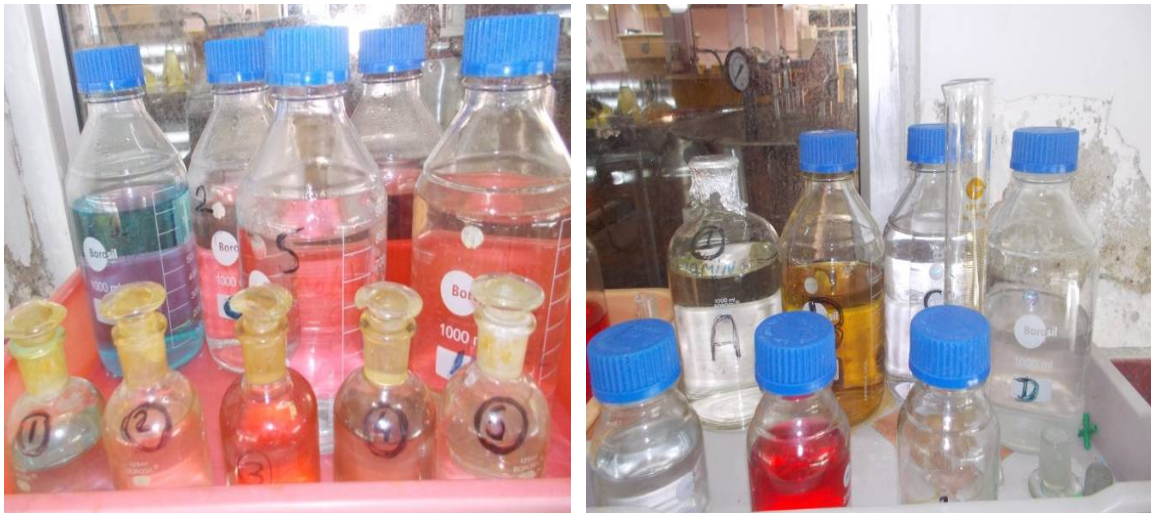
Fig. 2. F/2 medium

F/2 medium (Guillard, R. R. and Ryther, J. H. 1962) is widely used enriched seawater medium designed for growing marine algae culture. Commonly used for the indoor culture of Isochrysis and outdoor culture for the Nannocloropsis , Chlorella , Diatoms like Chaetoceros , Skeletonema , Thalassiosera , Tetraselmis etc.