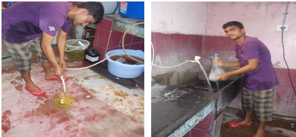
Fig. 3. Cleaning of glass wares

Add 500 ml of the stock solution to 100 L of tap water.