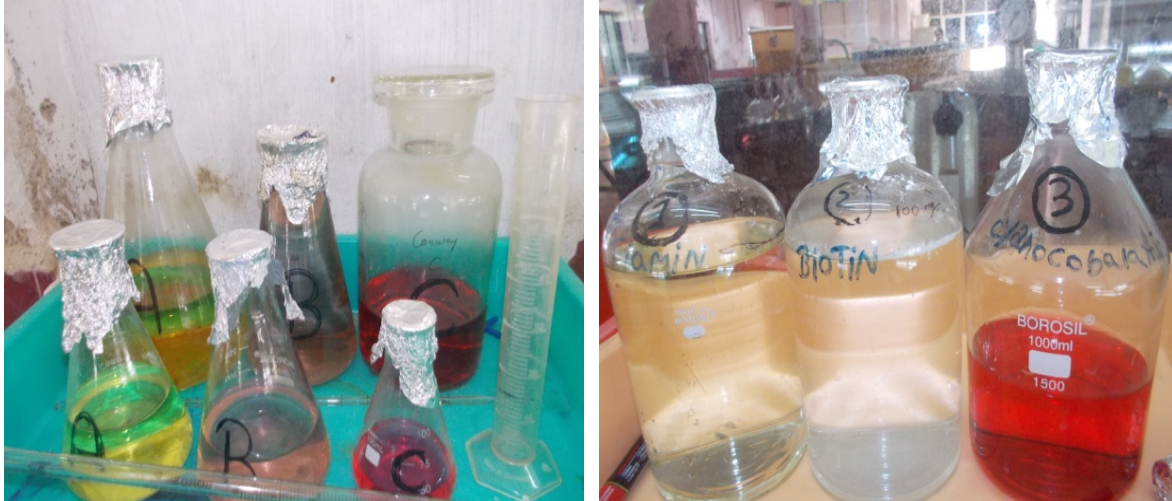
Fig. 1. Conway medium

F/2 medium (Guillard, R. R. and Ryther, J. H. 1962) is widely used enriched seawater medium designed for growing marine algae culture. Commonly used for the indoor culture of Isochrysis and outdoor culture for the Nannocloropsis , Chlorella , Diatoms like Chaetoceros , Skeletonema , Thalassiosera , Tetraselmis etc.