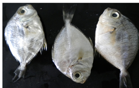
Figure 1. Photograph of L. splendens collected from SW and SE coasts and sampling sites showing SW coast and SE coast of India.

The fatty acid composition of the total lipids in the edible tissue of L. splendens from SW and SE coast of India were determined as described elsewhere (Chakraborty et al., 2013; Chakraborty et al., 2014). GLC data were recorded on a Perkin-Elmer (USA) AutoSystem XL gas chromatograph (HP 5890 Series II) connected with a SP 2560 (crossbond 5% diphenyl 95% dimethyl polysiloxane) capillary column (100 m X 0.25 mm i.d., 0.50 µm film thickness, Supelco, Bellefonte, PA) using a flame ionization detector (FID) equipped with a split/splitless injector, which was used in the split (1:15) mode. The GC analyses were accomplished using an oven temperature ramp program: 140°C for 1 min, rising at 30°C / min to 250°C, where it was held for 1.0 min, followed by an increase of 25°C /min to 285°C, where it was held for 2.0 min, until all peaks had appeared. The injector and