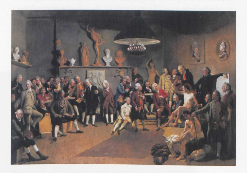
Fig. 1 Johann Zoffany Portraits of the Academicians of the Royal Academy in London, 1771/72 The Royal Collection, Her Majesty Queen Elizabeth II

The painting marks an important point in the development of London's Royal Academy of Arts, which had been founded just a few years earlier in 1768. Having moved into its new premises in the recently completed Somerset House in late 1771, it now boasted a prestigious address on the banks of the Thames. This, to Zoffany's mind, presented an ideal opportunity not only to highlight the principles of the training provided by the Academy and the long tradition underpinning them, but also,