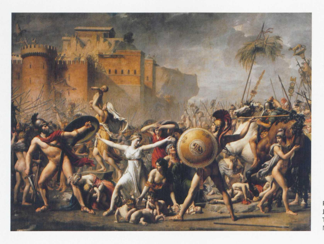
Fig. 2 Jacques-Louis David The Intervention of the Sabine Women, 1799 Musée du Louvre, Paris

Winckelmann's next book, a much larger and more ambitious history of ancient art called Geschichte der Kunst des Altertums (1764), soon became a European bestseller, and excerpts from the same in translation were printed for example in several English newspapers.<sup>6</sup> In this work, as in his first treatise, Winckelmann treated the artful representation of the male body in Classical and Hellenistic Greece as a reflection of what was then reality, and repeatedly identified freedom as the most important precondition of such bodies and of such art. This, of course, was also an oblique way of criticizing his own, unreformed times.7 The Age of Pericles was singled out for special praise, which is why his encomium to beautiful male bodies with their passions stoically reined in was also popular in revolutionary France. The resolute composure of the figures in the canvases of Jacques-Louis David (1748–1825) is proof of this. The poses of the heroes in his monumental Intervention of the Sabine Women (1799; Fig. 2), despite the high