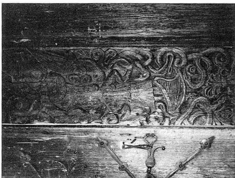
FIG. 10. UVDAL PORTAL.