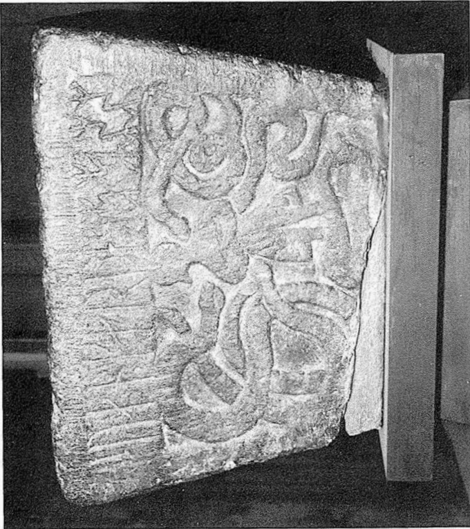
FIG. 8. BÄHUSLEN FONT.