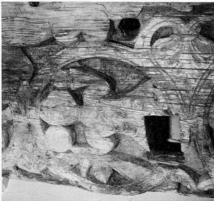
FIG. 6. MAN WITH DISC AND HORN, NESLAND PORTAL.