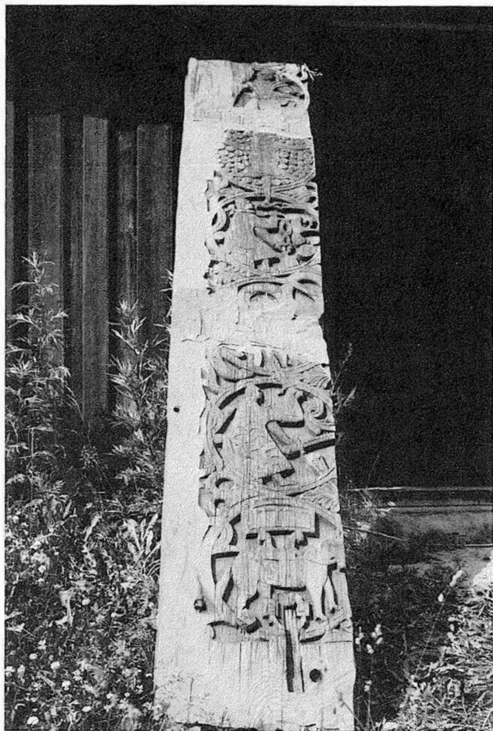
FIG. 2. MAEL PORTAL.