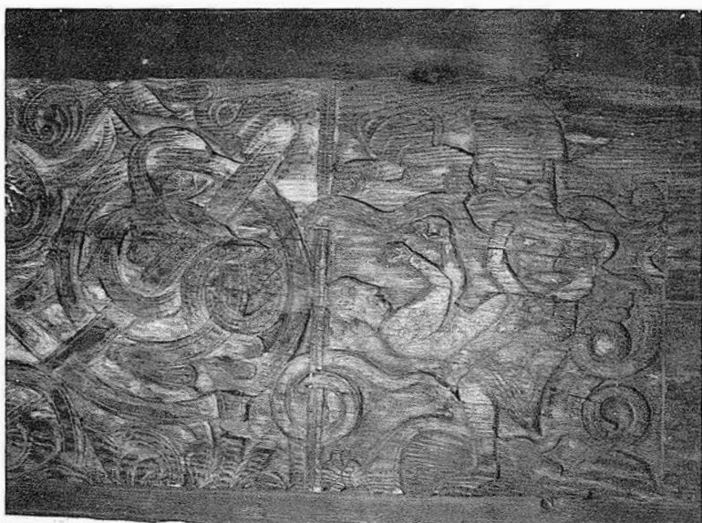
FIG. 11. AUSTAD PORTAL.