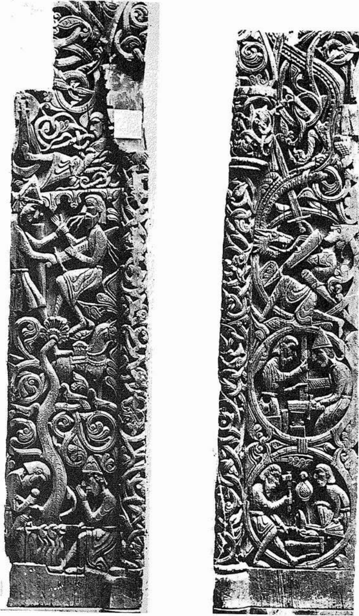
FIG. 1. HYLESTAD PORTAL. Reprinted from Emil Ploss, Siegfried-Sigurd, der Drachenkämpfer (Köln: 1966), by permission of the publisher, Böhlau Verlag.