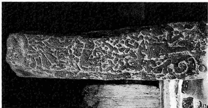
FIG. 7. RAMSEY CROSS.