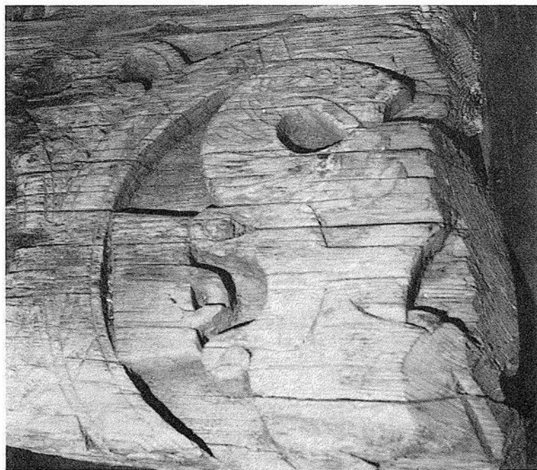
FIG. 4. GRANI WITH TREASURE CHEST, NESLAND PORTAL.