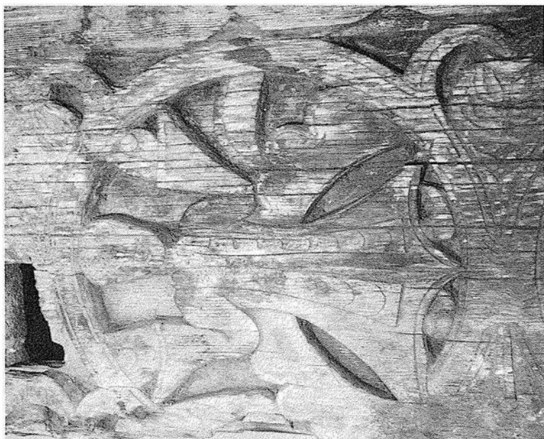
FIG. 5. MAN IN CLERICAL STOLE, NESLAND PORTAL.