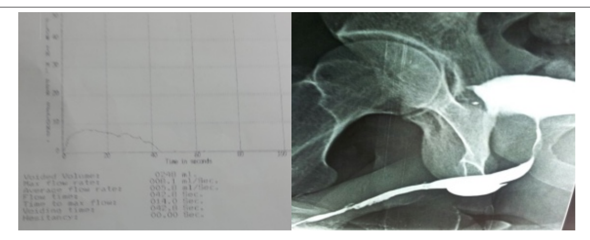
Fig. 1A: Uroflometry Suggestive of Stricture Pattern, Fig. 2B: Retrograde Urography Suggestive of Penile Stricture with Bulbar Urethral Diverticulum

with obstructive voiding symptoms. No evidence of lichen sclerosis was noted in any of the patients on examination and meatus was normal in all patients. Patients were evaluated with uroflometry and retrograde urography with micturating cystourethrography (Fig.1). The average Q max on uroflometry was 7.4 ml/sec ranging from 7-8.1 ml/sec. The first patient had a long segment bulbar stricture and a bulbar urethral diverticulum on retrograde urethrogram. The other two patients had segmental stricture with a long segment penile stricture and a short segment bulbar urethral stricture.