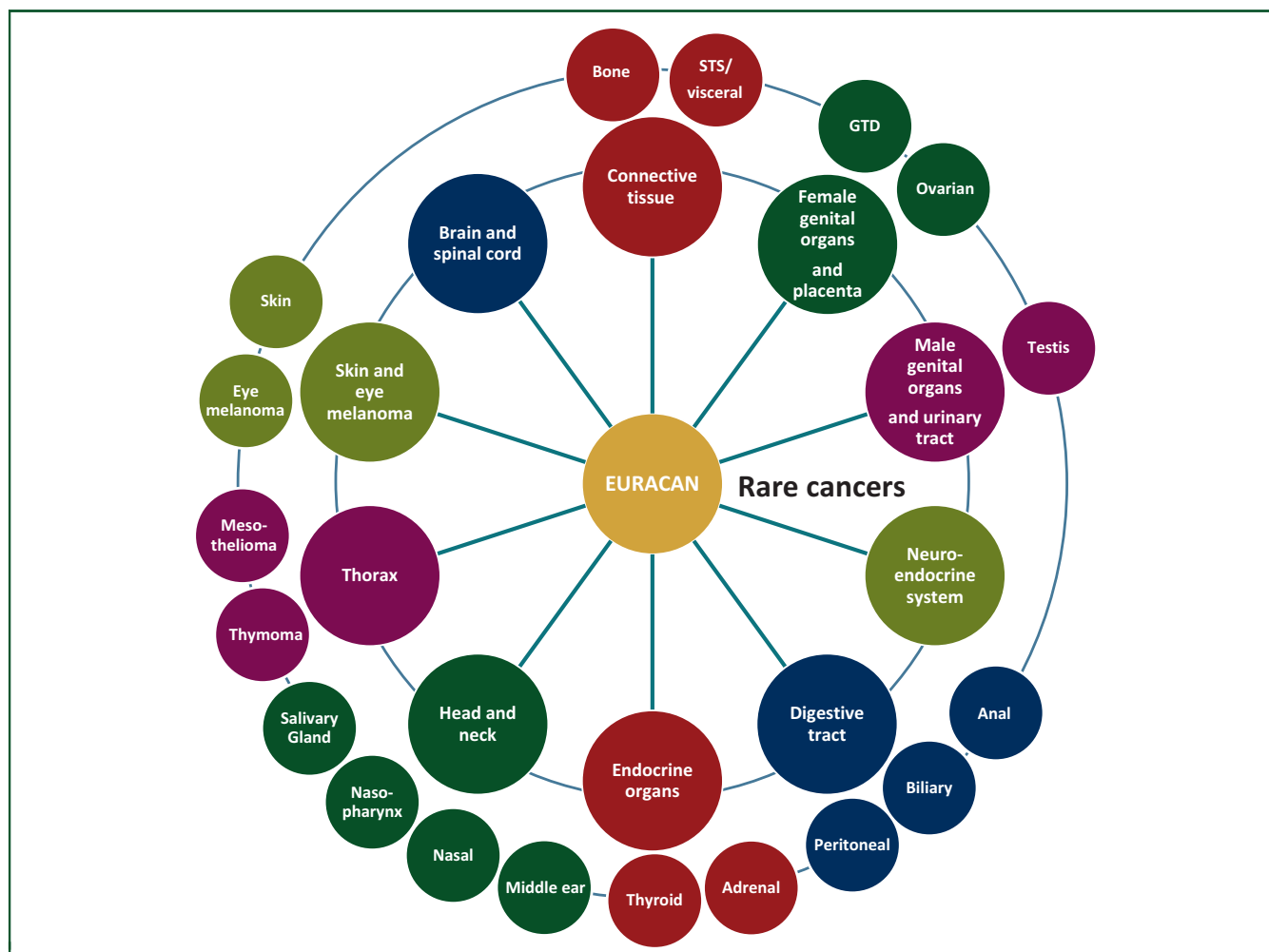
Figure 1. Rare adult cancers.