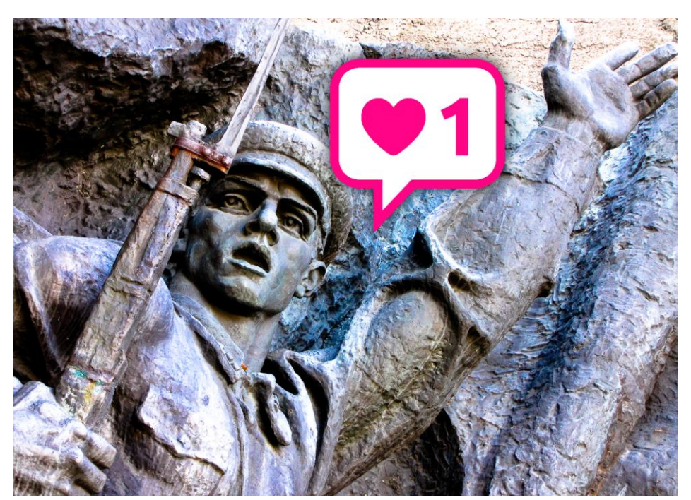
Figure 5. The statue of a soldier in the National Museum of History of Great Patriotic War in Kiev receives one heart. (2009, B. Fakhamzadeh).

Many of the task cards in Dérive app suggest using the senses to discover and uncover place. Visual culture is becoming more standardized throughout the world, and how we visually interpret the world around us is becoming more and more uniform. But, how are we to interpret smell, sound or touch, which are mostly absent as aspects of our globalised culture? This is much more individual, and thus more unique. Observing the smell of a place, or the way it sounds, particularly when overlaid with sounds presented through the consumption of a sound walk, creates a unique experience which can not be repeated, while taking in a much broader scope of the sensory range of the individual.