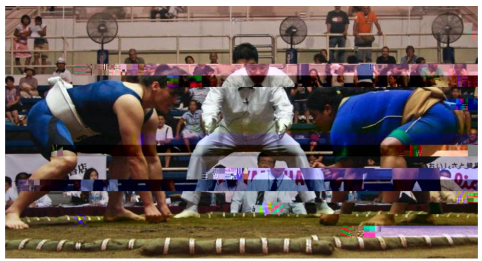
Figure 4. A glitched image of two sumo wrestlers, taken at the World Sumo Championships (2007, B. Fakhamzadeh).

including a venue is whether beer is served. As with Kompl , the app does not include indicators of reported quality or popularity, which provides a randomised, but directive, experience. By having the users pick their destination based on atypical criteria, or no criteria at all, the app nudges the user towards embracing discovery.