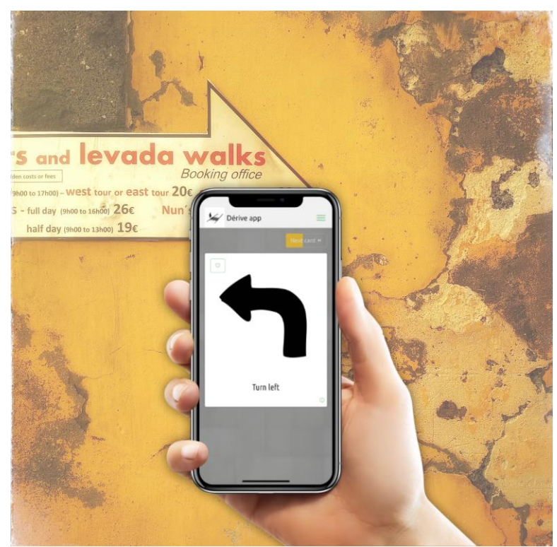
Figure 1. A wall showing a sign nudging visitors to participate in city walks during a Dérive app workshop in Funchal (2019, B. Fakhamzadeh).

BF: In 2012, South African artist Eduardo Cachucho and I created <u>Dérive app</u>, a collaborative digital platform for the creation and use of decks of task cards to be used in the style and spirit of the dérive , deployed through a mobile app. We were inspired by Guy Debord's "Theory of the Dérive" (1956), in which he defined the dérive as a period of time where one or more persons drop their relations, their work and leisure activities, "and let themselves be drawn by the attractions of the terrain and the encounters they find there" (Debord 1956).