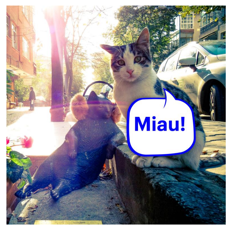
Figure 2. A cat saying "Miau!" next to the statue of Tomboli, wearing earmuffs, in Istanbul (2016, B. Fakhamzadeh).