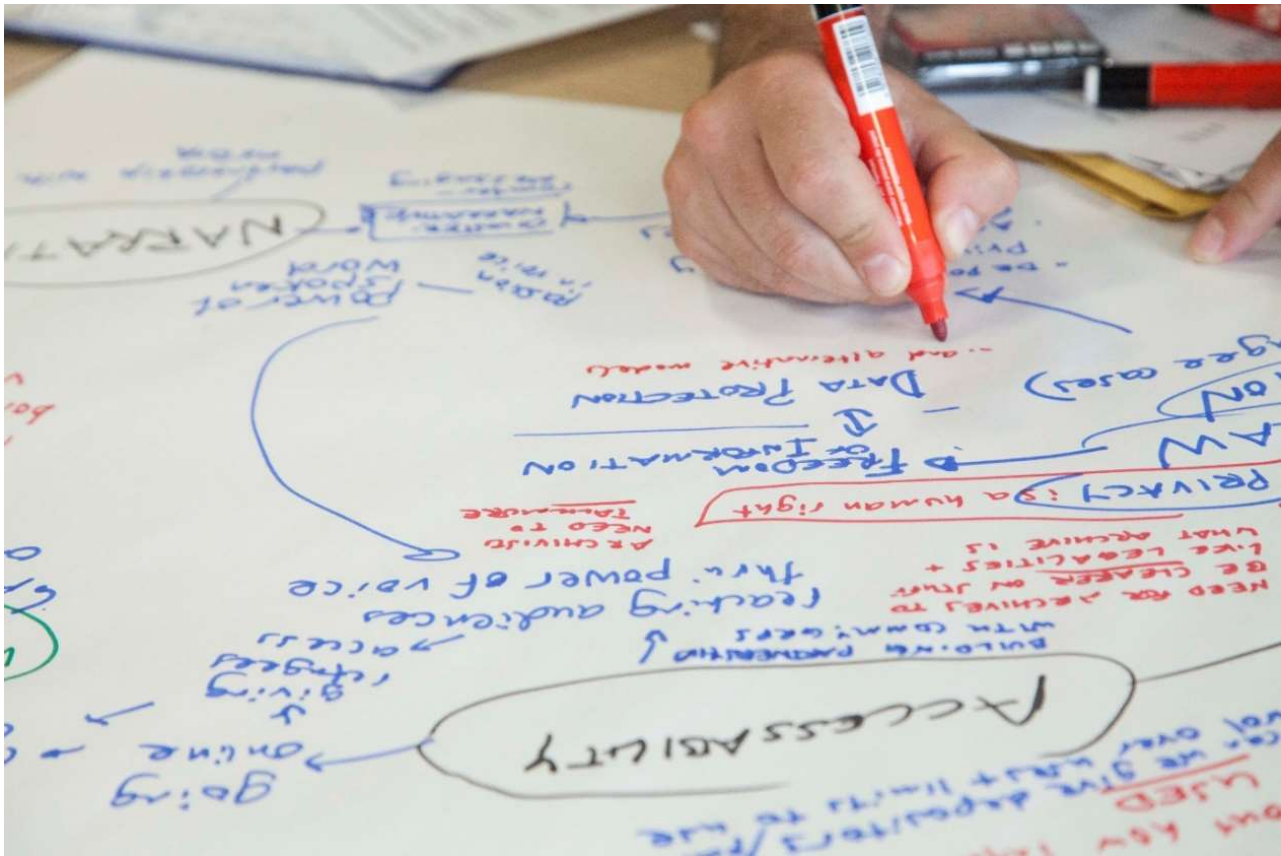
Image from the project launch event.