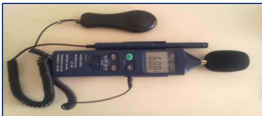
Figure 2. The device of measuring noise intensity (Fulfici-2237-model).

The study used two Fulfici-2237-model devices to measure noise intensity ( Figure 2 ).