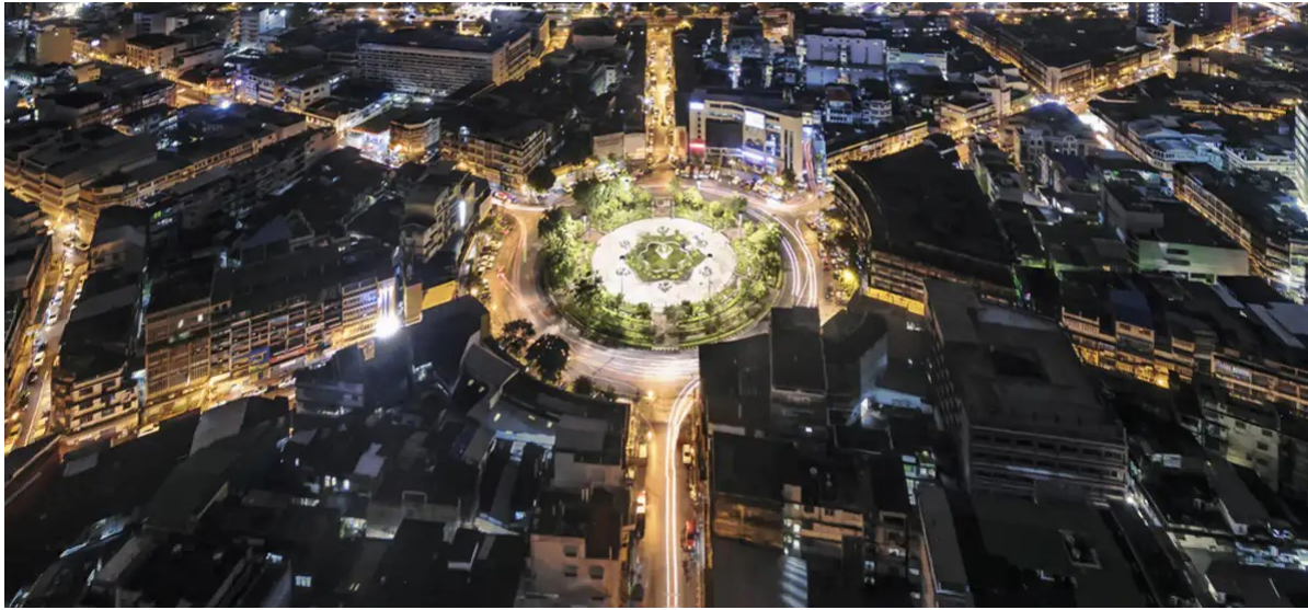
Navigated by self-driving cars.

Advances are still needed in order to enable the widespread use of such vehicles, not only to improve their ability to drive completely autonomously on busy roads, but also to ensure a proper legal framework is in place. Nevertheless, car manufacturers are engaging in a race against time to see who will be the first to provide a self-driving car to the masses. It is believed that the first fully autonomous car could become available as early as the next decade.