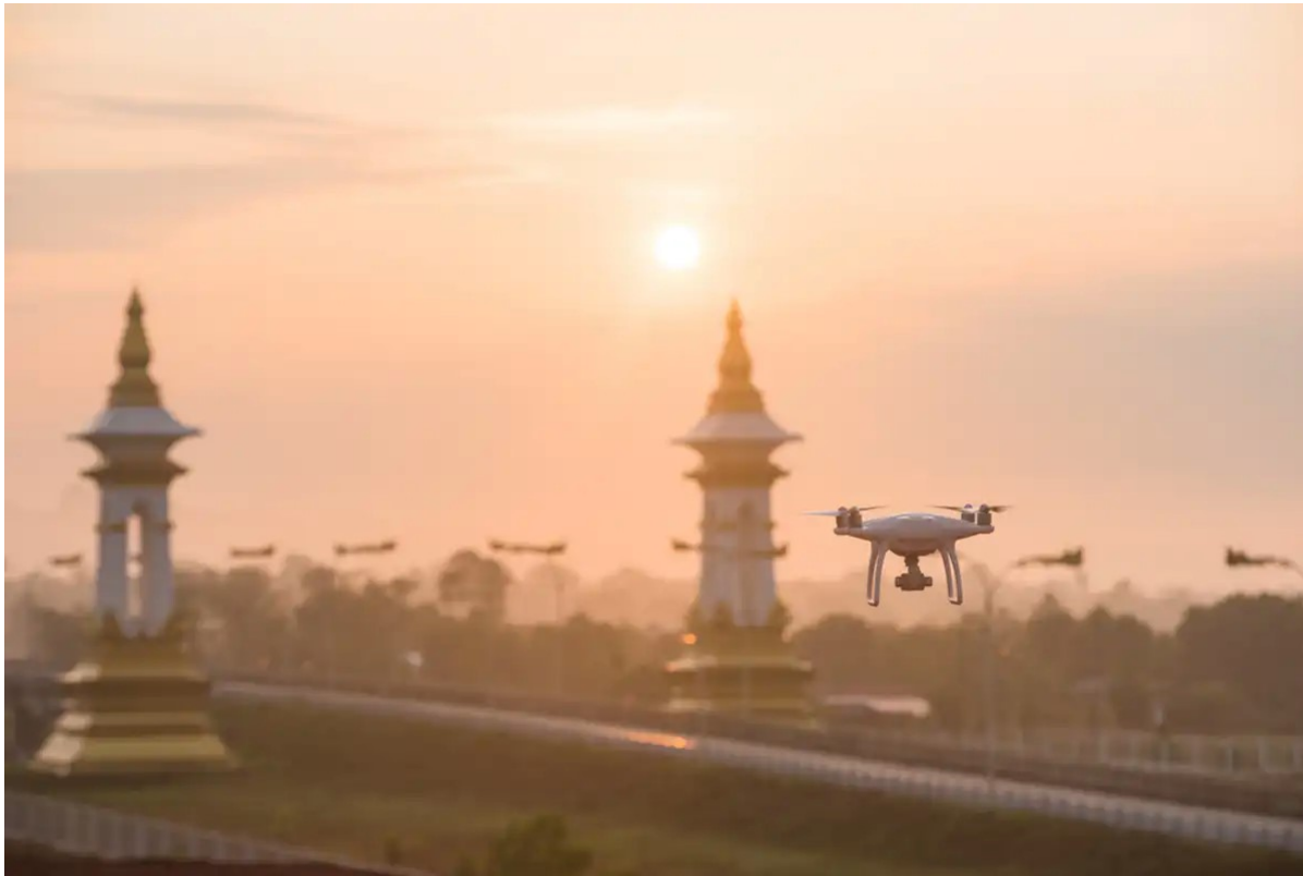
The new postman.

Self-driving vehicles are arguably one of the most astonishing technologies currently being investigated. Despite the fact that they can make mistakes, they may actually be safer than human drivers. That is partly because they can use a multitude of sensors to gather data about the world, including 360-degree views around the car.