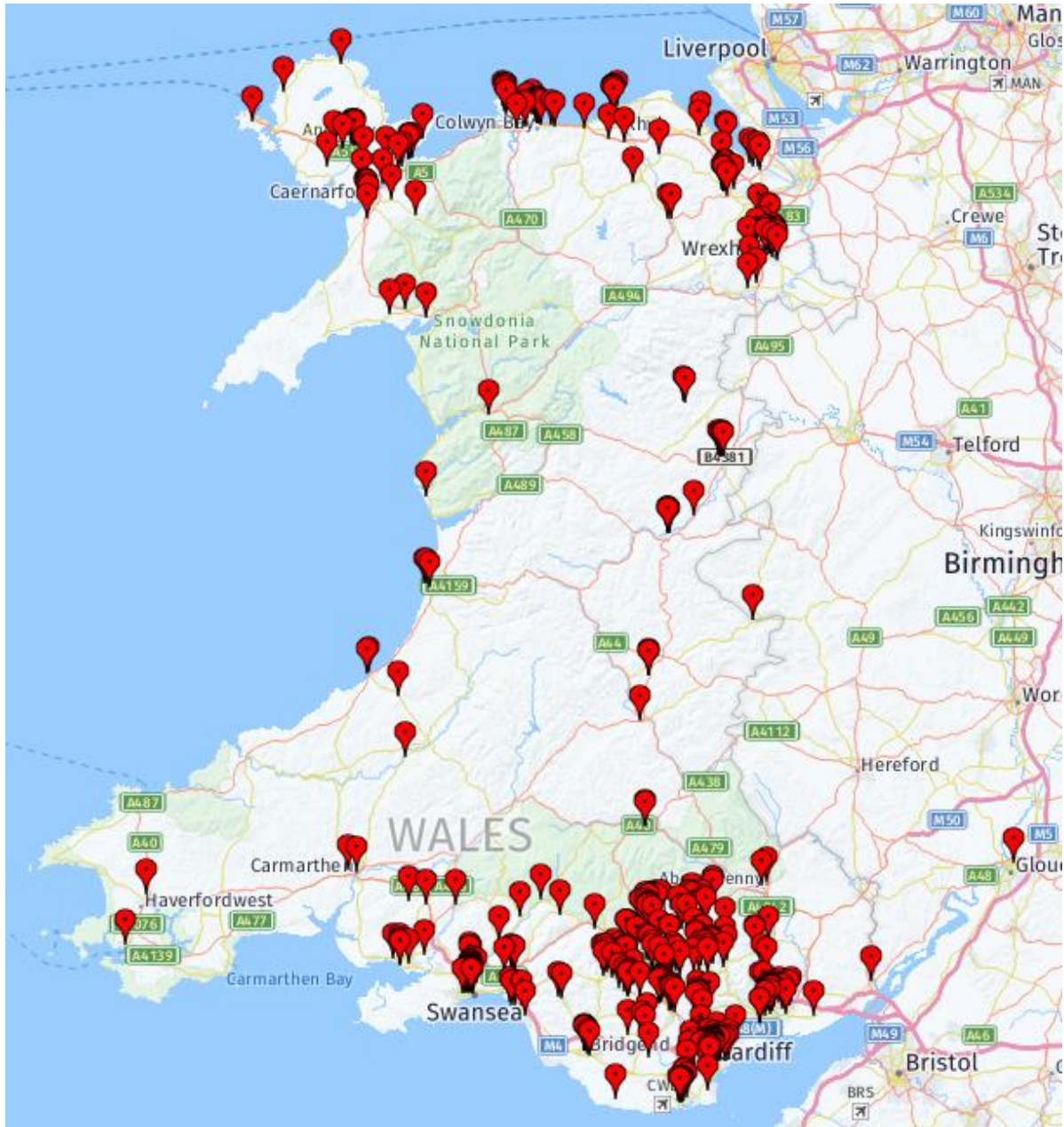
Source: Map provided by Addysg Oedolion Cymru/Adult Learning Wales