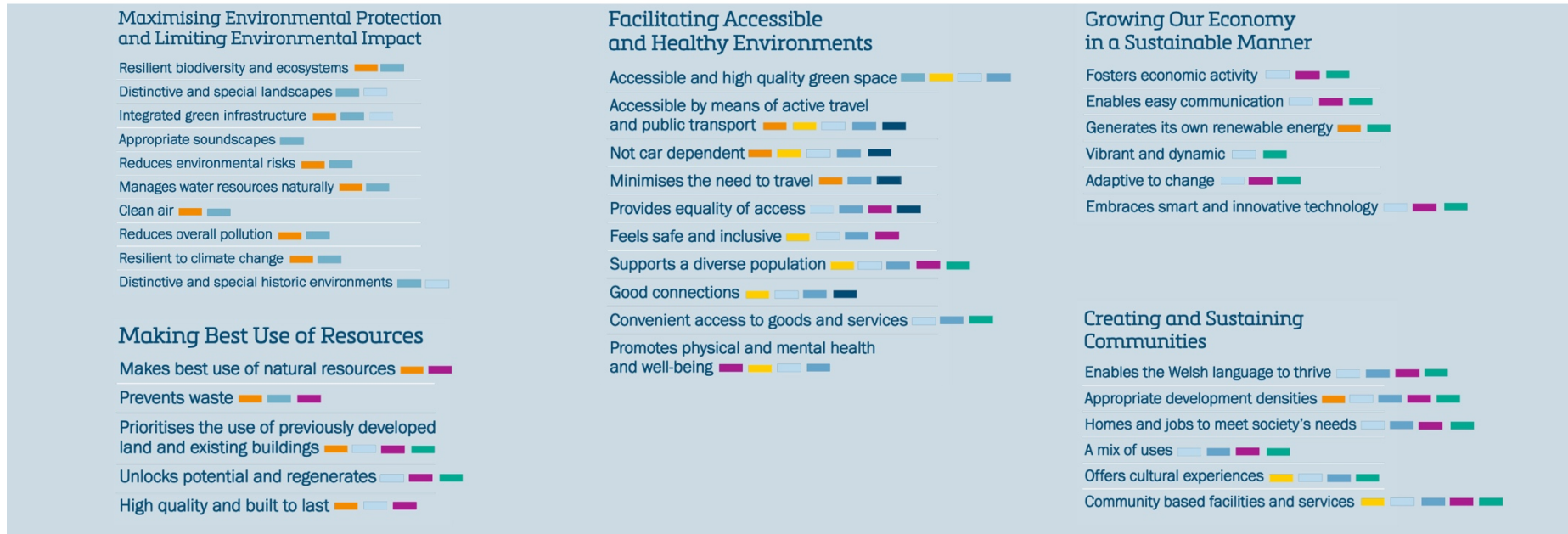
Figure 2 Alignment with National Planning Framework and National Strategic Outcomes