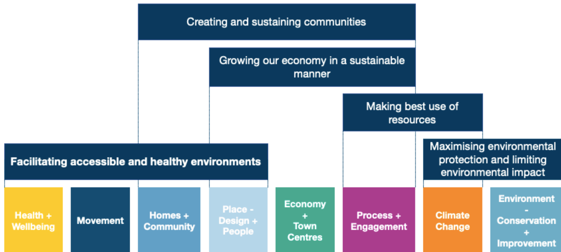
Figure 1 Wales's National Sustainable Placemaking Outcomes and the Toolkit Themes.