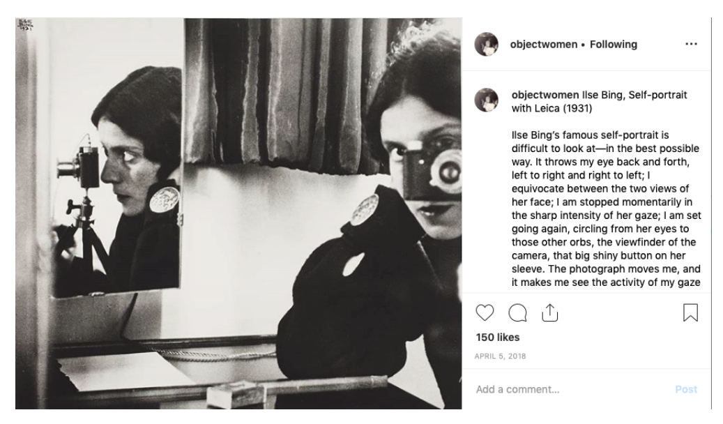
Screenshot from "Object Women," 2018

At the same time, I do think there's potential for existing digital platforms to be used for critical purposes, namely to disrupt the myths of progress and development that still structure our visions of the past and our sense of our place in history.