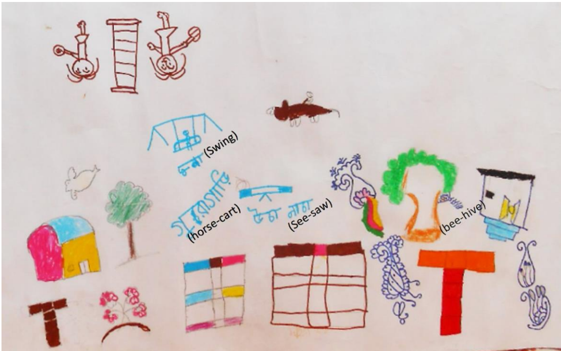
Figure 1: Children's drawing of the school ground showing interdependence of plants and animals

Further aspects of the natural environment were rivers or ponds with fish, boats and water lilies. 8% of the drawn elements were water bodies to explore and enjoy: 'I want to play with fish and ducks in the water' (Girl 2) (see Figure 2). According to the teachers, a waterbody in the schoolyard would not only be enjoyable and entertaining, but also educational. It has the potential to teach children about the flow of water and the water cycle.