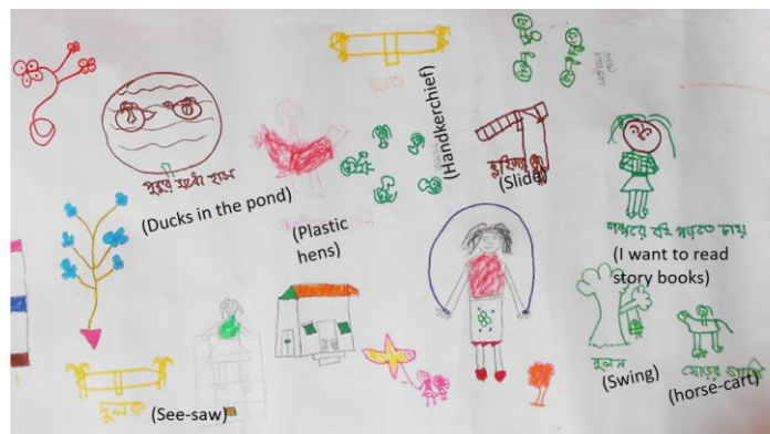
Figure 2: A drawing showing children exploring natural and manufactured play elements and engaged in solitary play or in groups

Science teacher: Children themselves can put fish and plants into water and observe how fish live in water.