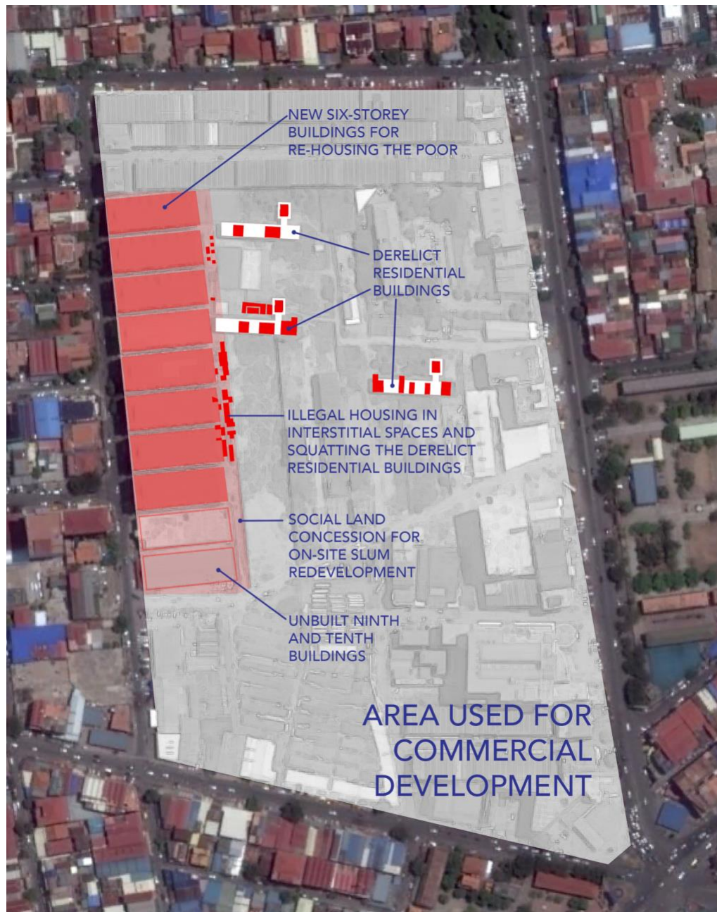
Figure 1. Map and aerial view of today's Borei Keila: in evidence the land given as a social concession to the poor, the land used for commercial development, and the area where today's slum settlement lies (elaborated by first author).