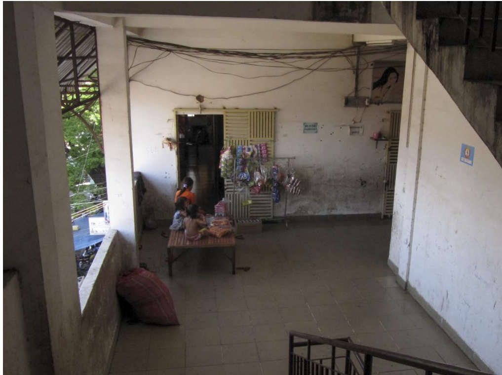
Figure 4. Borei Keila's new housing for the poor: the everyday use of common spaces on the upper floors.