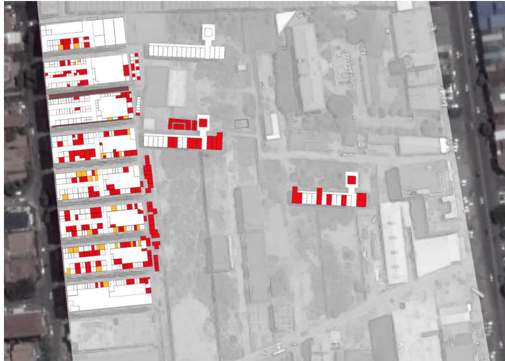
Figure 6. Map of nowadays' ground floor, with the residential units, in red, and the mixed use units, in orange, in evidence (survey by first author, with the help of MSc BUDD students, and CAN-Cam young professionals).

1 The official version of the document is in Khmer language, but an 'unofficial' English translation was made available by the Ministry of Land Management, Urban Planning and Construction itself.