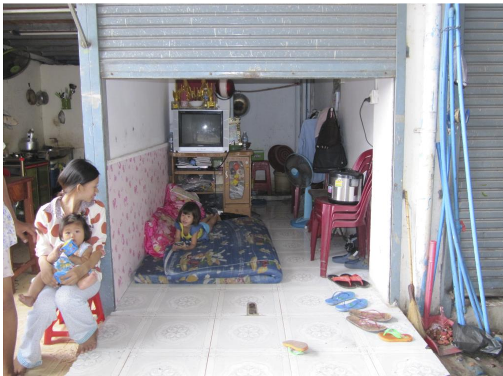
Figure 5. A residential unit on the ground floor.