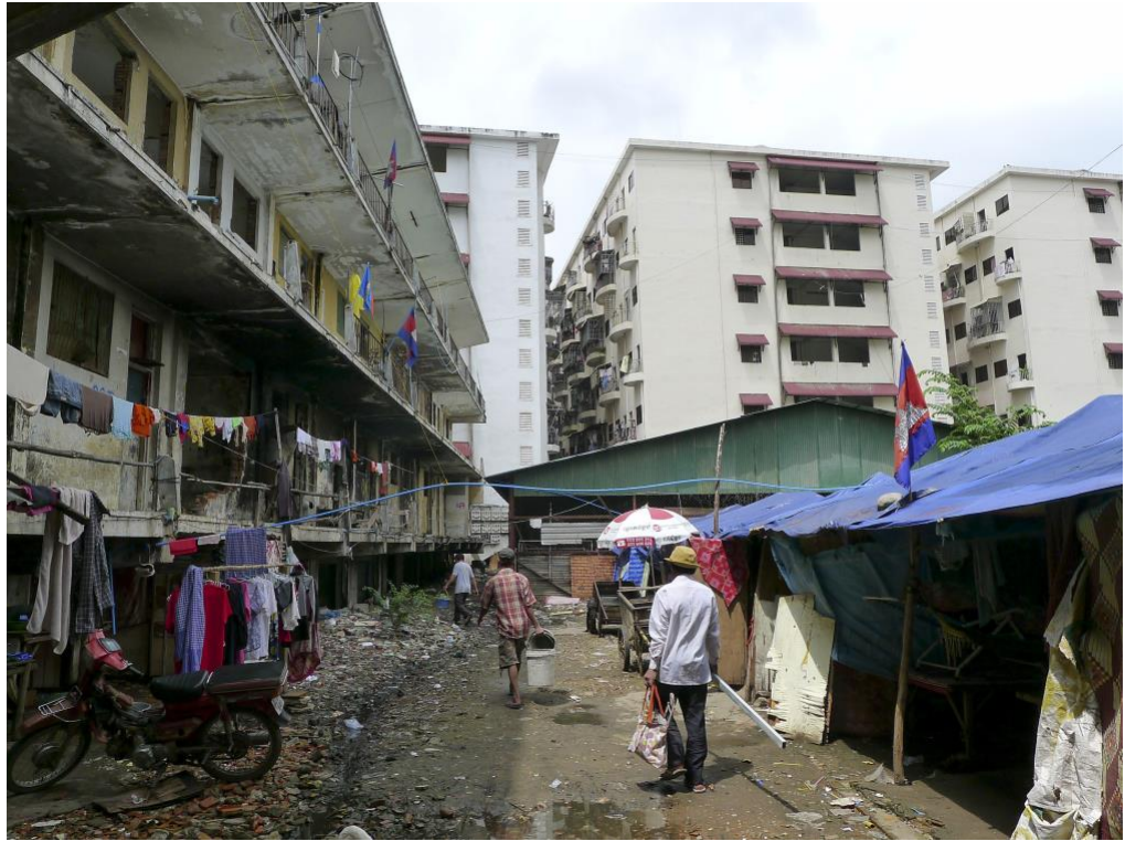
Figure 2. Borei Keila: a picture shot from today's slum settlement, with the new housing for the poor in the background.