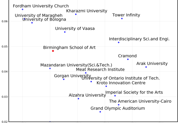
Figure 1: Projection of a 100-dimensional semantic space and 10-dimensional facets of buildings. Top: showing the full space. Bottom: showing the 10-dimensional representations for the facet X_i = \{ campuses, students, offices, centers, facilities, area, hotels, homes, bridges, hospitals, cities, shops, stations \}

additional domains, for which we used Wikipedia articles: buildings and organisations. In particular, we retrieved all Wikipedia pages whose semantic type on WikiData corresponds to building or organisation. Wikipedia pages containing fewer than 200 words were removed. The bagof-words (BoW) representation of the remaining Wikipedia concepts were obtained using a standard preprocessing strategy (e.g. removing HTML tags and references), including stopword removal with NLTK (Bird and Loper, 2004). Furthermore, we POS tagged the documents and only retained the nouns and adjectives. Finally, frequent words that occurred in more than 60% of the Wikipedia articles about buildings (resp. organisations) were removed, as well as words that occurred fewer than 10 times. This approach was taken to stay broadly in line with the strategy that was used in (Derrac and Schockaert, 2015). As classification tasks, we used two attributes from WikiData in