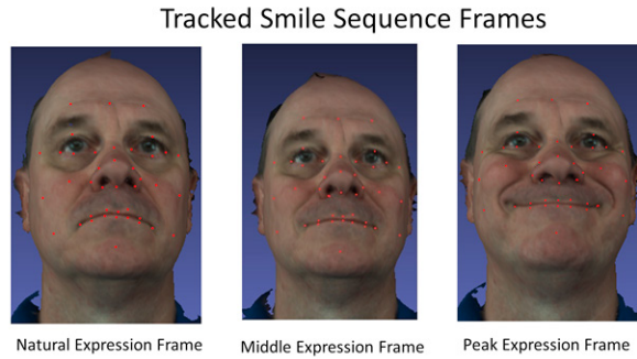
Fig. 2. Tracked Smile Sequence Frames

Most facial expressions are composed of three non-overlapping temporal phases, namely: the onset, apex, and offset. Onset is the initial phase of a facial expression and it defines the duration from neutral to expressive state. Apex phase is the stable peak period (which may be short in duration) of the expression between onset and offset. Offset is the final phase from expressive to neutral state. Following the registration step, the onset, apex, and offset phases of the smile are detected using the approach proposed by Dibeklioglu et al. 23 . Smile amplitude is estimated as the mean amplitude of the right and left lip corners, normalized by the length of the lip. Let D_{lip}(t) be the value of the mean amplitude signal of the lip corners in frame t .