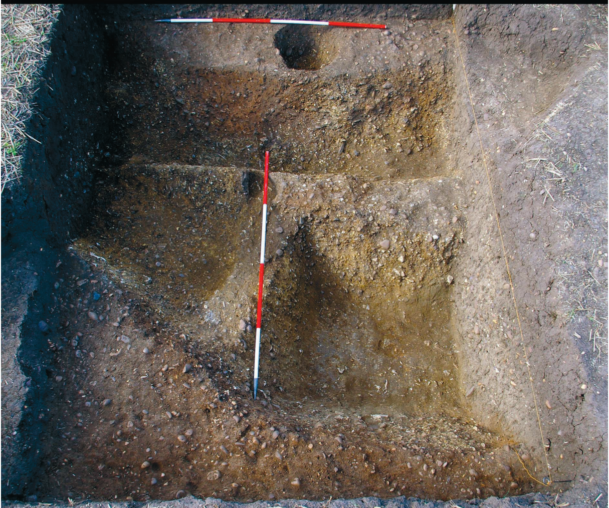
Fig. 1.3 Whitchurch, Warwickshire. Trench 6 excavated.

The copper alloy assemblage largely comprises metalworking residues including casting waste and an ingot, which together with the mould fragments suggest metalworking was an important part of the settlement activity. There was also an important assemblage of objects which included a socketed axe and a late palstave; tools including a chisel, punch, awl and razor; fragments from weapons, and a wide range of ornaments including pins, rings and discs. The most interesting discovery was 20 miniature axes (Waddington 2007; Figure 1.4). This assemblage was a very unexpected discovery as, until recent reporting through the Portable Antiquities Scheme, only a small quantity of miniature axes had been discovered, mostly from Wiltshire (Robinson 1995). These were thought to date to the Iron Age or Roman period, and a Late Bronze Age date was unexpected.