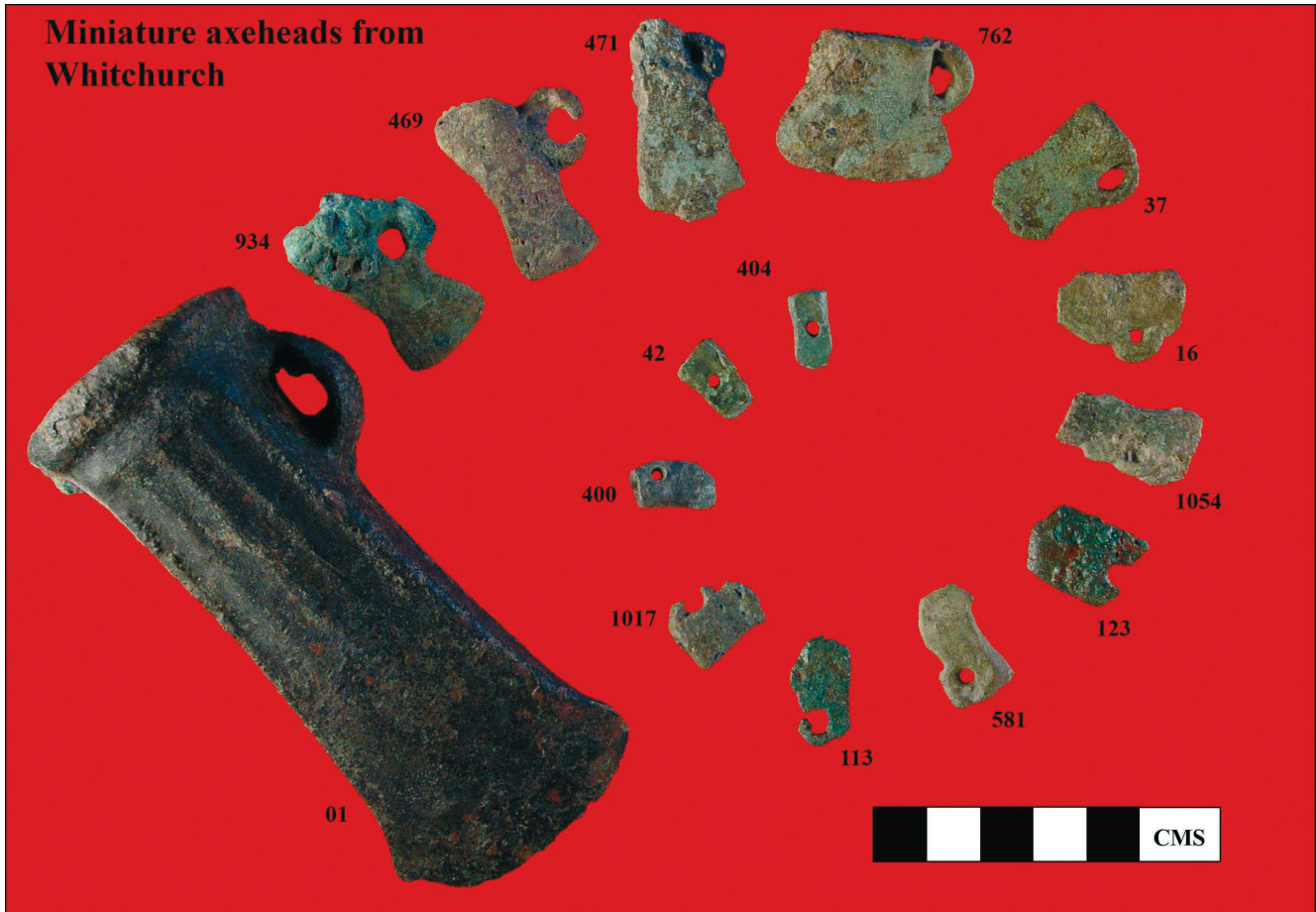
Fig. 1.4 Whitchurch, Warwickshire. Copper alloy axes, including rare miniature examples.

would not have been predicted on the basis of previous work in the region and indicate the complexity of the archaeological record. The Portable Antiquities Scheme has also produced a surprising number of finds that challenge the accepted view that the West Midlands is impoverished (Bolton, this volume). It should also be remembered that Staffordshire is one of the few areas of Britain outside East Anglia which has produced gold torcs, such as at Glascote (Painter 1971).