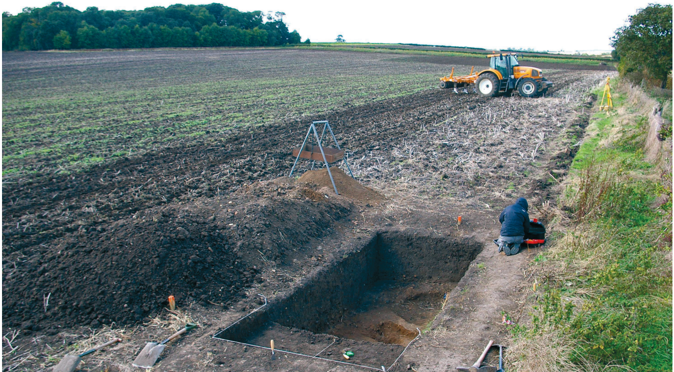
Fig. 1.2 Whitchurch, Warwickshire. General view of site locality with Trench 4 in foreground.

Despite the small-scale nature of the research, the excavations produced an enormous assemblage of finds: 251 copper alloy artefacts, 7,512 sherds of pottery, 519 fragments of fired clay (including briquetage and spear mould fragments), 47 pieces of worked bone, 16 stone tools and a blue glass bead. The pottery assemblage from the midden and contemporary settlement features belongs to the post-Deverel-Rimbury decorated tradition that dates to the period around 850/800–550/500 cal BC (Brudenell in Waddington and Sharples 2011), and is almost unique for the whole region. 17,890 animal bones were recovered dominated by sheep, but with relatively high numbers of pig, a feature of many other midden sites (cf. Madgwick in Waddington and Sharples 2011). The presence of isolated bones of beaver and wild boar are important.