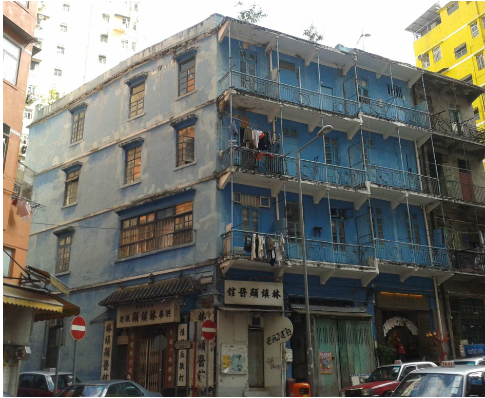
Figure 2. The Blue House

The Blue House is a single four-storey traditional Chinese tenement house, which was built in the 1920s. Under the Antiquities and Monuments Ordinance, the Blue House was preserved and confirmed as a Grade 1 Historic building by the Antiquities Advisory Board in 2010, indicating that the building comprises invaluable historical and cultural values (The Antiquities Advisory Board, 2013). Particularly, these buildings reflect the collective histories of the Chinese medical services, post-war schooling, and chamber of commerce for fishmongers of the community (The Blue House Cluster 2011). Under a partnership between the URA and HKHS, they launched the development scheme of the Blue House project under Section 23 (1) and Section 25 of the URA Ordinances on 31 March 2006 (The Notices of Gazette H05-026, 2006).