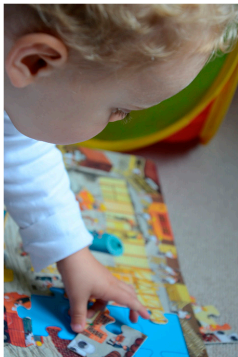
Fig. 2. Illustration of a template image. This template image was used to generate the two-tone image shown in Fig. 1A, Left . To experience the effect of knowledge on perception, the reader should look back at Fig. 1A after having viewed this template for some time. The perceptual experience of the two-tone image in Fig. 1A, Left , should have drastically changed from the initial viewing: rather than looking like meaningless patches, a coherent percept of the child and parts of the puzzle should now be experienced. The control image in Fig. 1A, Right , should still appear as meaningless patches.