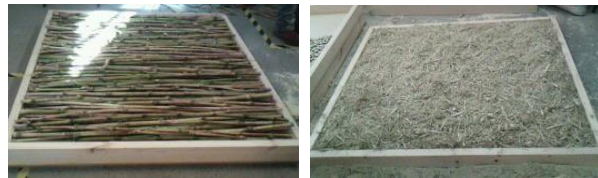
Figure 5.- Quila perpendicular to heat flow. Figure 6.- Quila chipped with garden shredder. Test panels before closing.

In order to comply with the Chilean standard which states that samples should be reasonably presented with flat, parallel faces five sample panels were constructed, 4 with a softwood frame 1375mm x 1555mm x 90mm faced with 9mm MDF leaving a space of 1293mm x 1473mm x 90mm. this space was then filled with the selected insulations (figs. 3-7). The fifth panel consisted of two 9mm MDF boards nailed together to allow the deduction of their conductivity in the calculation of the coefficient of the insulation materials. The densities were those achieved via manual compaction.