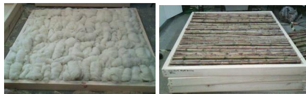
Figure 3.- Sheep's wool washed and carded. Test panel before closing with second MDF panel. Figure 4.- Colihue perpendicular to heat flow

The materials selected to be tested were. Sheep's wool washed and carded (fig.3), colihue laid perpendicular to heat flow (fig. 4), quila laid perpendicular to heat flow (fig. 5) and quila chipped with a mobile garden shredder (fig. 6). Chipped colihue was not tested due to the hardness of the material.