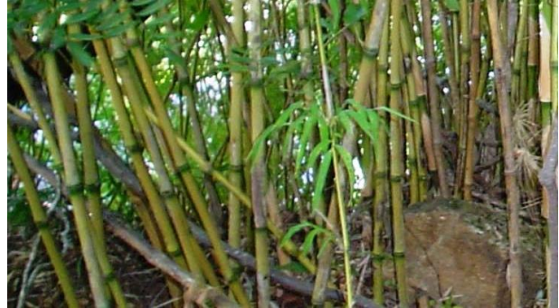
Figure 1.- Colihue ( Chusquea culeou )

Colihue is a straight growing bamboo which does not branch (fig 1.). It grows to a height of up to 6m with an average cane diameter between 13 and 16mm [5]. In its chemical composition lignin represents 23.9% and cellulose 72.4% [5]. Currently colihue is used in Chile as garden canes, for furniture making and as a decorative internal finish for walls and ceilings. The canes are also used for placing dynamite charges in mining installations, this being the most common use of colihue in Chile with the state copper mining company CODELCO ordering 800.000 canes per year [6]. Prices range from $60 Chilean pesos for canes 1m in length up to $800 pesos for widths greater than 25mm. Although colihue is sold commercially it is not cultivated, instead it is collected wild from forests with machetes, with between 100 and 200 canes being harvested per day depending on cane stem width [6].