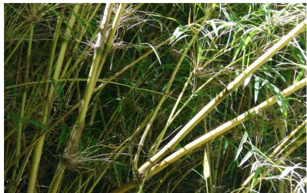
Figure 2.- Quila ( Chusquea quila )

Unlike colihue, quila branches, is more crooked and has a smaller diameter (fig.2). In its chemical composition lignin represents 18% and 48 % cellulose. As it forms