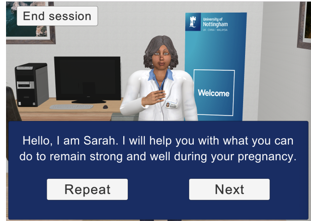
Figure 1: ALTCAI's participant's interface in virtual-human based modality.

ALTCAI, as a desktop application, is composed of multiple application windows representing: 1) the participant's interface, which is the window that the participant sees and interacts with, 2) the wizard's interface, which is the window that the human operator uses to control the progression through the interaction and the behaviour of the participant's interface.