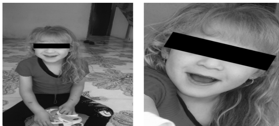
Fig (1): Facial appearance of the 8 - year old child with Angleman Syndrome. Fair complexion, blond hair and subtle dysmorphic features like prominent jaw (prognathism), pointed chin, broad and flat nose, broad forehead, long face, happy and smiling demeanor.