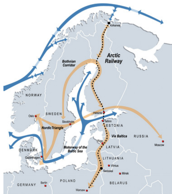
Arctic railway proposal between Gulf of Bothnia, Finnish Lapland and the Arctic Ocean.

The accessibility of the region could be also improved through hard infrastructure, such as through North-South transport connections. While the latter is merely hinted at in the new