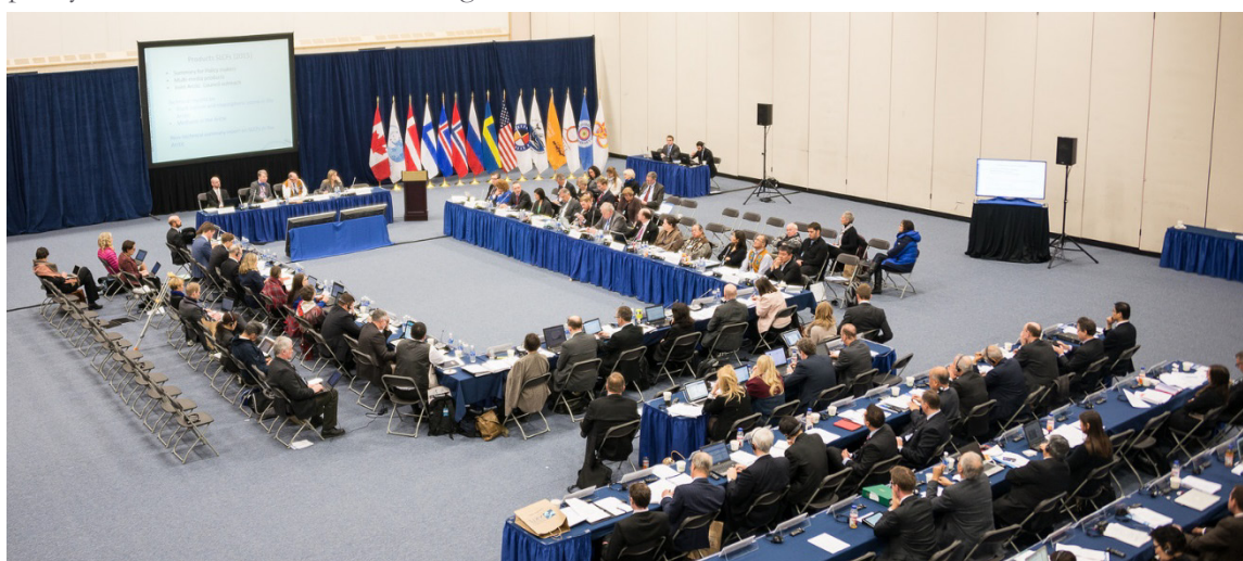
Arctic Council's Senior Arctic Officials' meeting in Yellowknife, NWT, Canada, 26 March 2014. Clear division between Arctic states and permanent participants (at the table) and observers in the back.