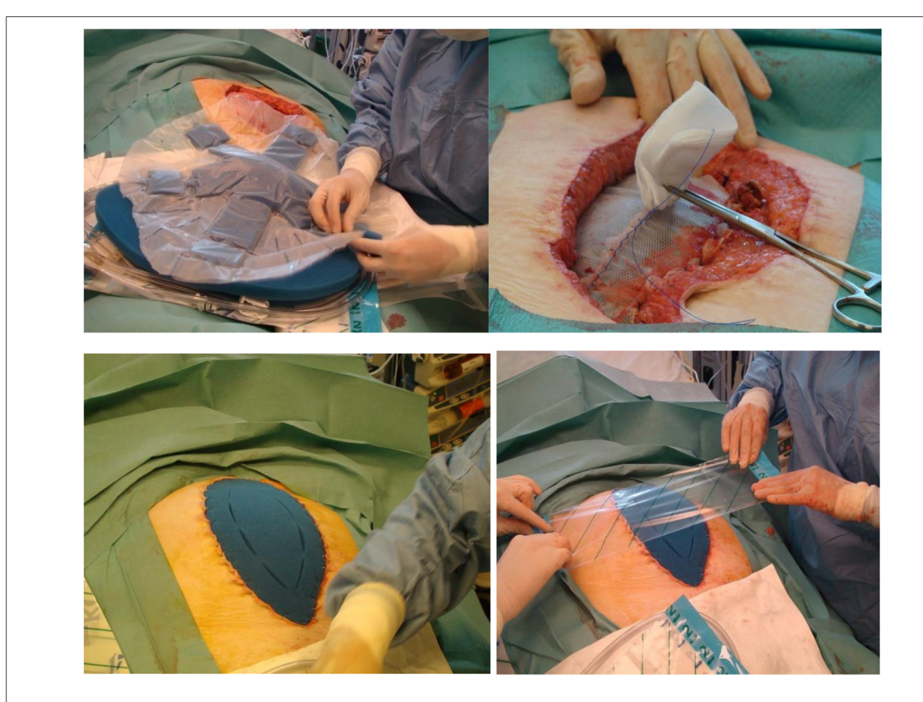
FIGURE 1 | Technique of vacuum assisted mesh mediated fascial traction.

Sex, Body Mass Index (BMI), age at time of surgery, indication for OA therapy, time between initial surgery and start of VACM, duration of VACM, complications and patient mortality were variables chosen for analysis based on their clinical relevance in regard to open abdomen management. Classification of the open abdomen was based on Björck's classification published in 2009 (7).