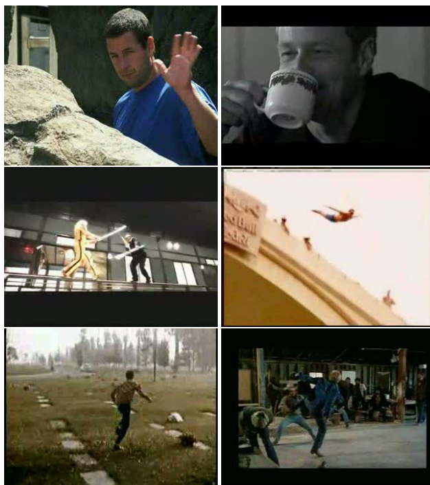
Figure 1. Sample frames from the proposed HMDB51 [1] (from top left to lower right, actions are: hand-waving, drinking, sword fighting, diving, running and kicking). Some of the key challenges are large variations in camera viewpoint and motion, the cluttered background, and changes in the position, scale, and appearances of the actors.

With several billion videos currently available on the internet and approximately 24 hours of video uploaded to YouTube every minute, there is an immediate need for robust algorithms that can help organize, summarize and retrieve this massive amount of data. While much effort has been devoted to the collection of realistic internet-scale static image databases [17, 23, 27, 4, 5], current action recognition datasets lag far behind. The most popular benchmark datasets, such as KTH [20], Weizmann [3] or the IXMAS dataset [25], contain around 6-11 actions each. A typical video clip in these datasets contains a single staged actor with no occlusion and very limited clutter. As they are also limited in terms of illumination and camera position variation, these databases are not quite representative of the richness and complexity of real-world action videos.