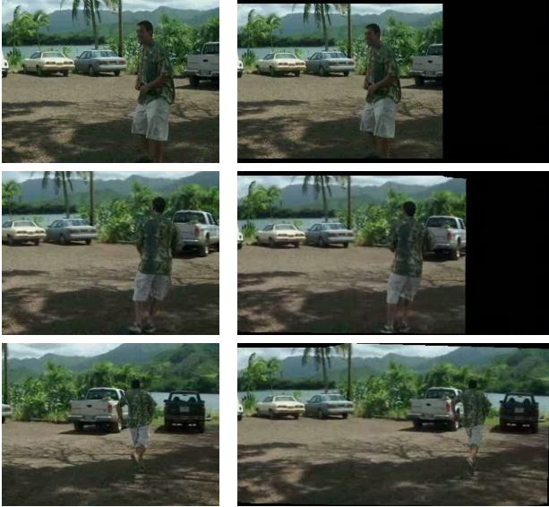
Figure 3. Examples of a clip stabilized over 50 frames showing from the top to the bottom, the 1st, 30th and 50th frame of the original (left column) and stabilized clip (right column).