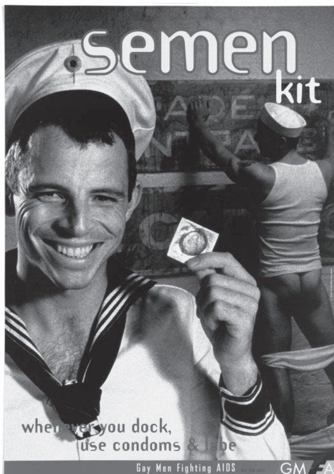
Figure 4: Issued by 'Gay Men Fighting AIDS', London, 1994 (59 × 42 cm), Hywel Williams photographer. Courtesy of the Wellcome Library, London. The image was reproduced on a 15 cm card, which was handed out at the Gay Pride festival in July 1994. The text on the card mentions the UK government's poor funding of safe sex campaigns and Parliament's homophobic reaction to the proposal of an equal age of consent of 16 for both hetero- and homosexuals.