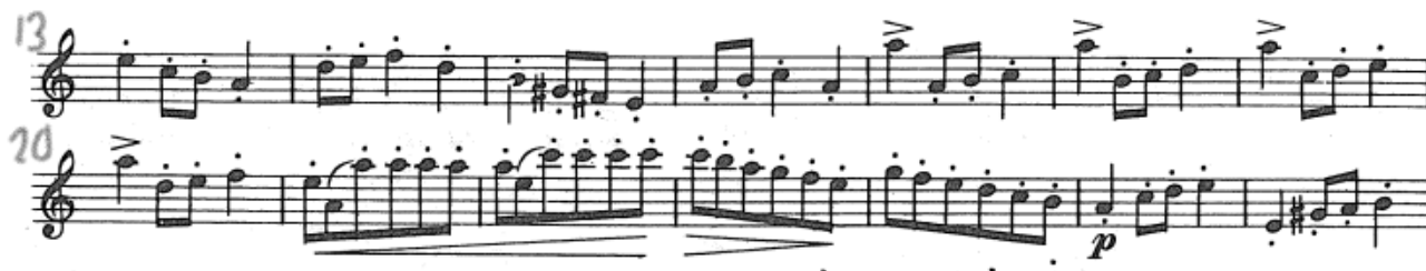
Figure 8. Rubank – “Etude in A minor,” mm 13-26. 69

change of support needed due to the pressure developed from the double reed. The student should be encouraged to release the tongue from the reed instead of attaching the reed with the tongue and practice using a “TU” syllable. Figure 8 is an example of an etude that focuses primarily on articulation.