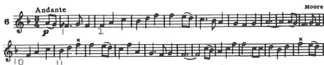
Figure 3. Gekeler – “Believe Me, If All Those Endearing Young Charms” mm 1-20. 60

there are three different ways to play F on the oboe: standard F, forked F, and Left F. An alternate F fingering is typically used when transitioning to or from a half-hole note. Some student model oboes will not have the mechanism for left F, but the student can still learn forked F which does not require any extra key mechanisms. Forked F should come naturally to the flutist as it is similar to the fingering for F on the flute. Figure 3 provides an example of when an oboist would use an alternate F fingering.