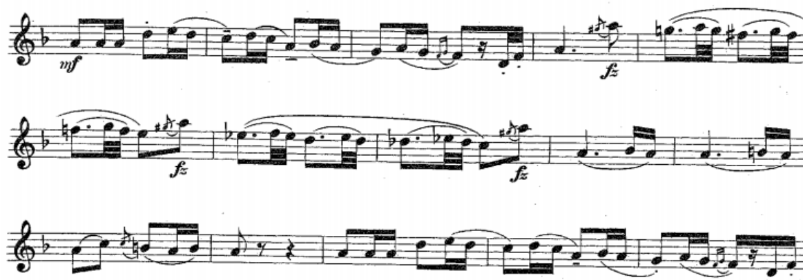
Figure 15. Nielsen – “Humoresque,” mm 61-75. 77

The second movement of this work is titled Humoresque and is a rhythmic upbeat contrast to the first movement and is shown in Figure 15. This movement utilizes three alternate fingerings: left Eb, right Ab, and alternate F so the student will have to learn these notes before attempting this piece, but the range does not extend pass C6 which is suitable for the intermediate to advanced student.