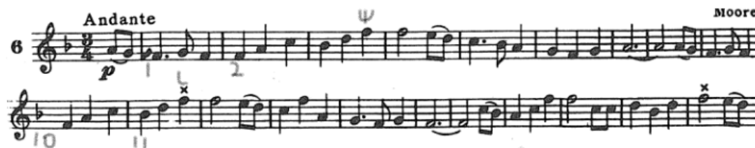
Figure 4. Gekeler – “Believe Me, If All Those Endearing Young Charms” mm 1-20. 61

This is the same example but this time in measure 3 the symbol for forked F is specified and in measure 11 the symbol for left F is specified. This piece is broken up into 3 ½ - 4 bar phrases so this piece challenges the student to play even longer and serves as a good opportunity to begin to talk about dynamics since this is the first piece that a dynamic marking is present. The flute and oboe differ in terms of how to create dynamic contrast. On the flute one must change the volume of air used as well as the direction, so a louder dynamic would require a greater volume of air and the air stream would be directed downward, and a softer dynamic would require less volume but be blown at a faster air speed that is directed upward. 62 The oboe on the other hand relies more on air pressure and oral cavity space opposed to air volume and direction. Regardless of the dynamic level the air volume should remain the same however for louder dynamics the oral cavity should widen and the air pressure should be increased, and for softer dynamics the oral cavity becomes a narrower, and the air pressure slightly diminished although the speed of air should increase. In general, for a louder dynamic the “OO” embouchure is broadened, and the chin and jaw will drop and flatten, in a softer dynamic level the “OO” embouchure becomes narrower so the corners push forward, the “OO” is accentuated, and the jaw and chin are pulled forward.