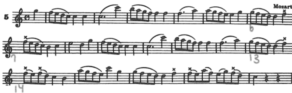
Figure 6. Gekeler – Melody by Mozart 66

the exception of F, F#, Bb, C, half-hole notes, and octave keys the transferring flautist will be familiar with many of the fingerings on oboe. The intermediate student will need to become acquainted with alternate F fingerings as soon as possible since they will most likely be playing in keys other than G major or D major. The student will also need to learn how to create a breathing plan with adequate inhalations and exhalations from the beginning as music at this level will contain longer phrases. Figure 6 displays an example of a short piece the intermediate student could use as an exercise to practice these skills.