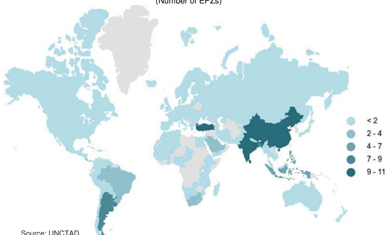
Figure 2: Geographic spread of EPZs covered in UNCTAD survey (Number of EPZs)

The data collection focused on the extent to which traditional business services, such as those related to customs, licensing, communications and tax, are promoted by EPZs, as well as sustainability-related services. While the study of public information cannot determine with certainty whether or not these services exist in the zones, the study does provide an accurate indication of what EPZs publicly promote or talk about having in their zones. The