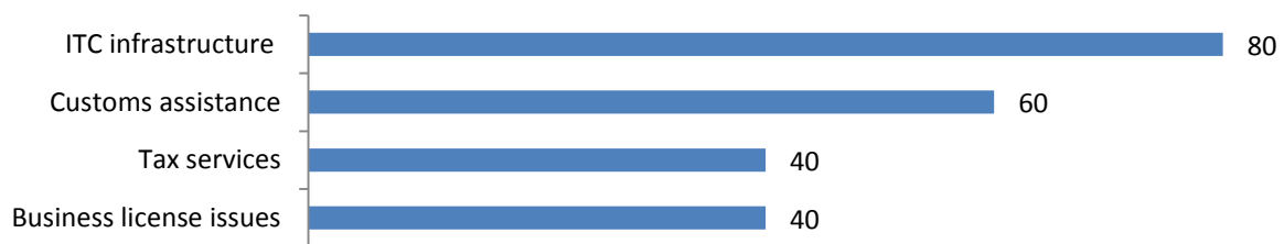
Figure 3. Traditional business features provided by EPZs Results of study of 100 EPZs. (Number of EPZs).