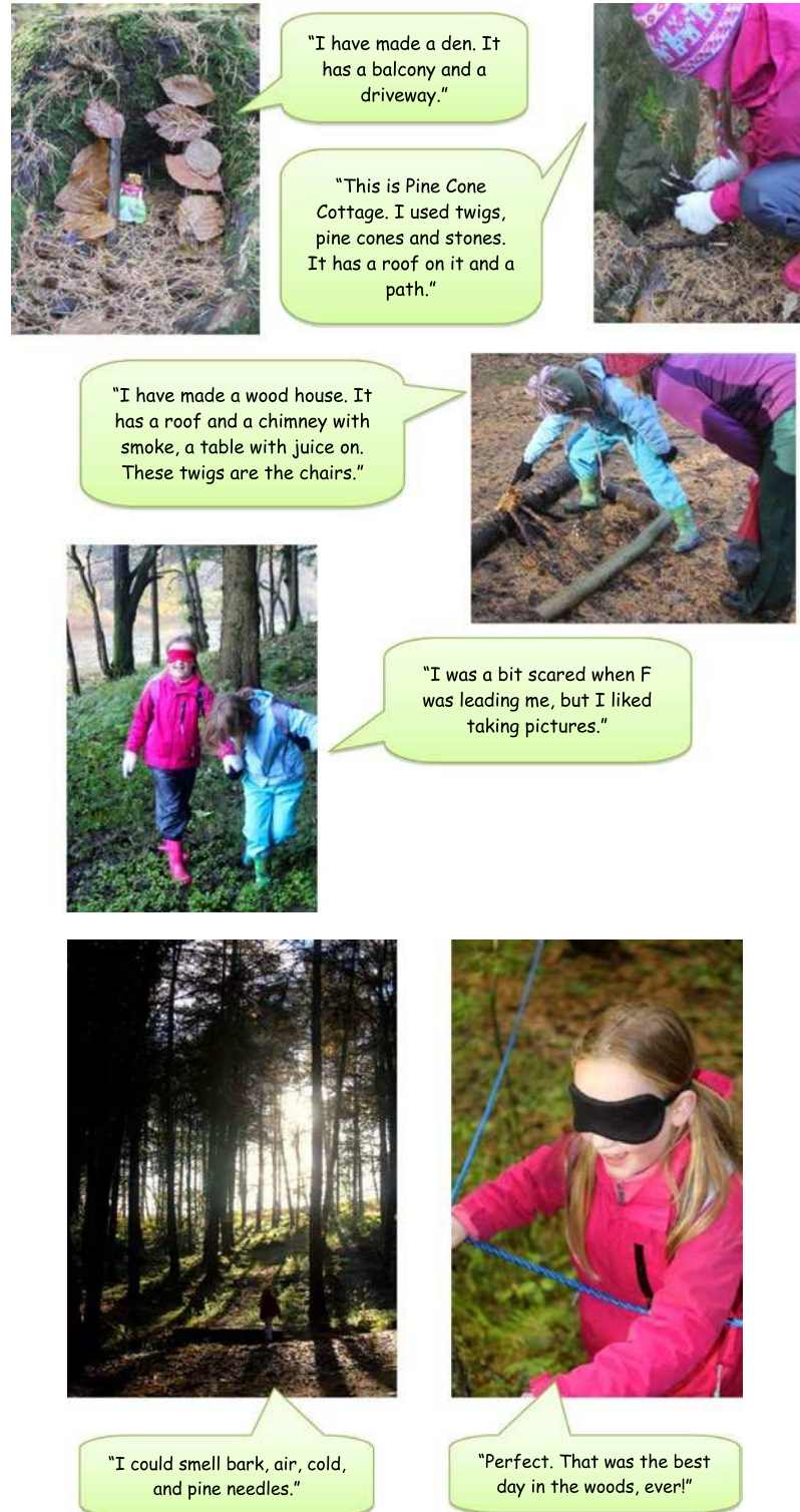
Figure 4. Exploratory Forest Schools day.