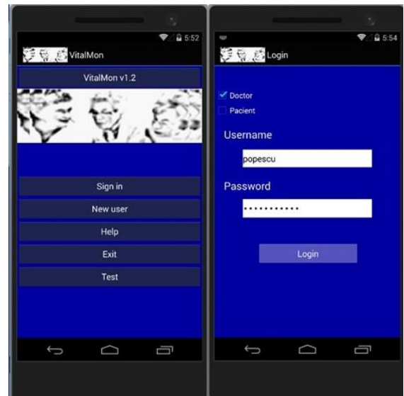
Fig. 3 Patient data management software-mobile app