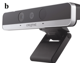
Fig. 1. (a) Oculus Rift DK2 13 ; (b) Intel RealSense 14