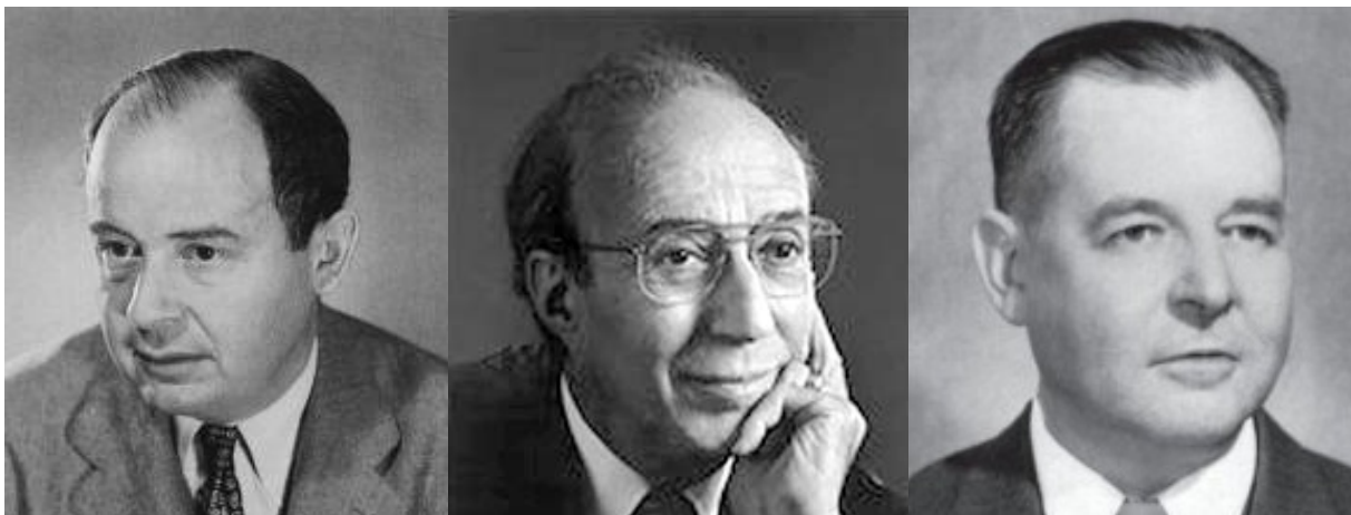
John von Neumann (1903-1957)

Figure 3: John von Neumann and Herman Goldstine were the authors of " Numerical inverting of matrices of high order " in 1947, often considered as the first paper of modern Numerical Analysis . Harold Hotelling was an influential statistician who introduced principal component analysis, among other contributions. In 1943, he did an error analysis of GE which led to general pessimism about its practical use in modern computers.