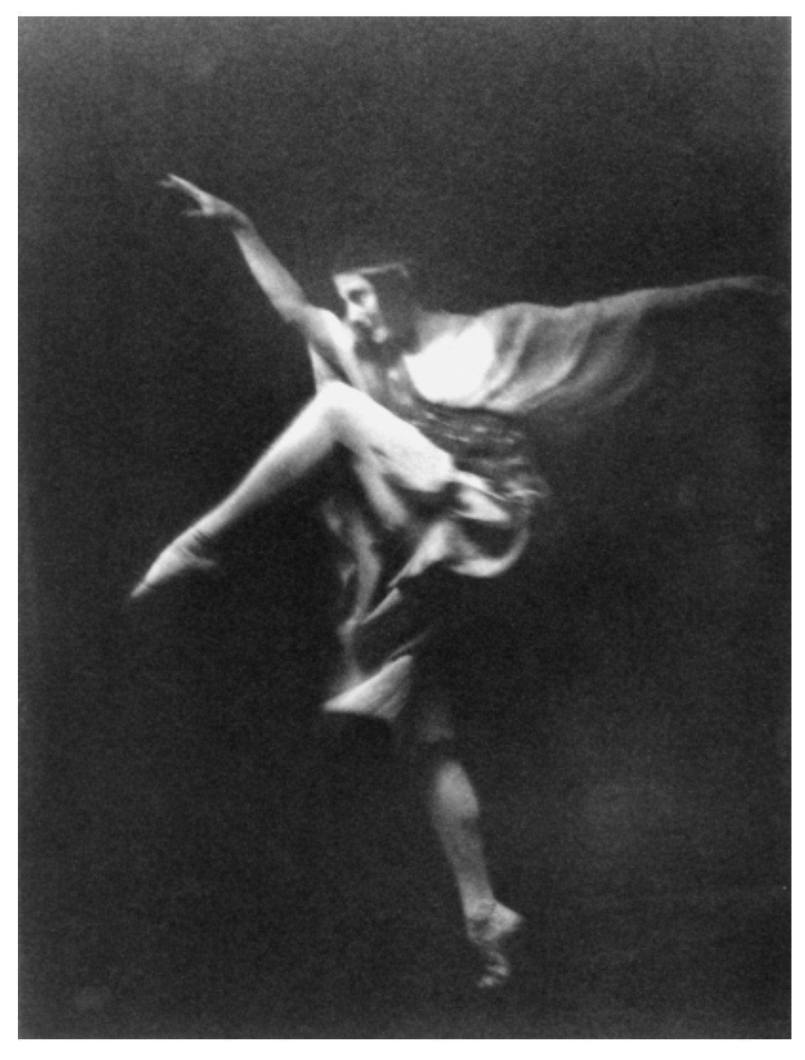
Figure 1: Anna Pavlova c. 1915.