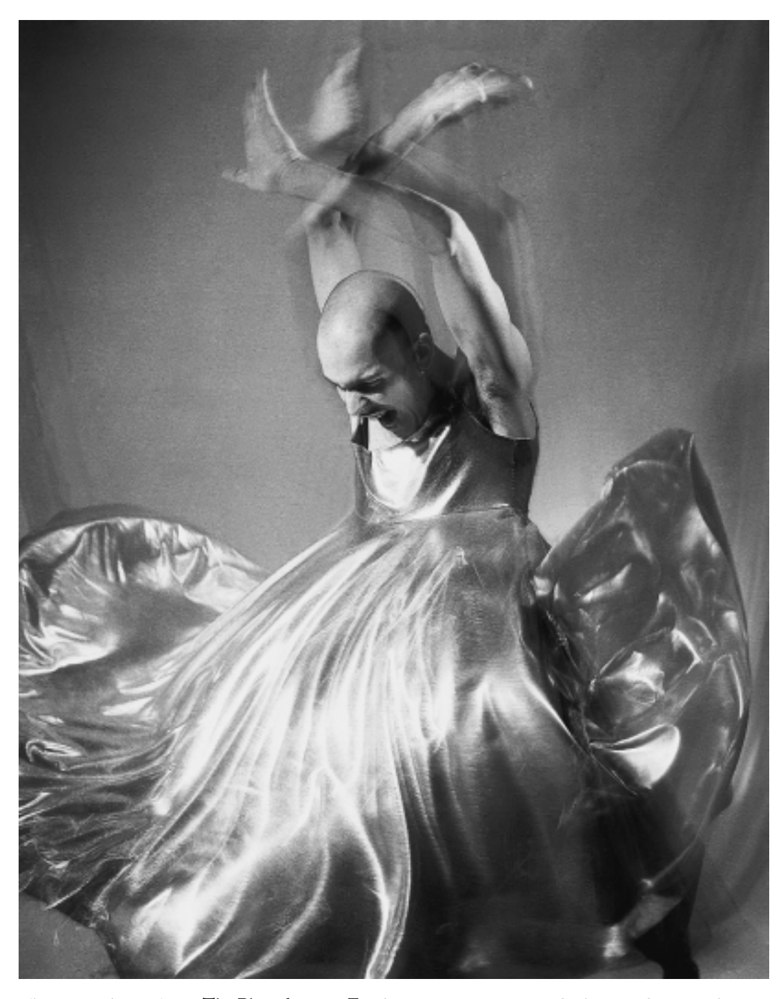
Figure 5: Javier de Frutos, The Place does not Forgive, 1995.