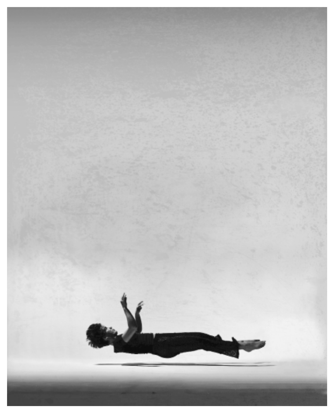
Figure 6: Motionhouse, Fake It, 1997.