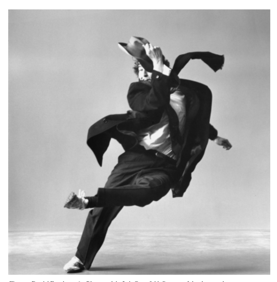
Figure 3: Daniel Ezralow 1982.

yond the photograph, the viewer expands the moment, adding narrative and movement to the stillness. Other Greenfield photographs manage to communicate movement in a similar fashion. One photograph features an unbalanced man, on one leg, falling to the side; here, the dancer's body shape, angle, and clothes indicate the movement. Again, the brief narrative of movement is there to be read into the picture (Fig. 3).