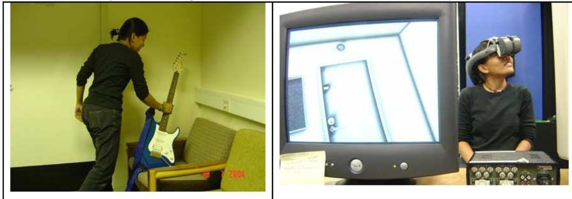
Fig. 3. Arrangement task in the physical room (left) after training in the synthetic room (right)