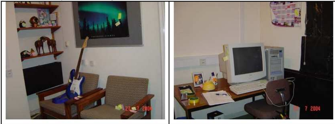
Fig. 1. Real-world experimental space after completion of object arrangement task