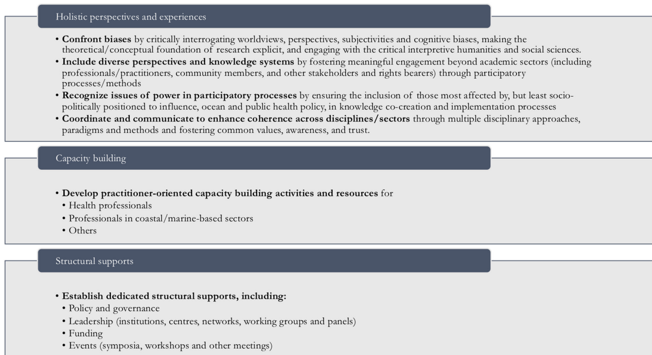
Fig. 3. Information derived from diverse perspectives (e.g., general public, policy makers), intellectual traditions and epistemologies, fields of scientific inquiry, approaches, and methods (e.g., empirical field/observational research, laboratory experiments, computational models, epidemiological modelling, clinical research, participatory and community-engaged research, analysis). Inference techniques can be highly complementary in yielding insights at the nexus of oceans and human health. Ensuring sustained collaboration and coordination, however, requires three key dimensions, namely—holistic worldviews and perspectives, dedicated capacity building opportunities, and structural supports.

traditionally emphasized biomedical issues and bioanalytical approaches from the toxicological, nutritional, and epidemiological sciences (Dewailly et al. 2002; Knap et al. 2002), whereas more broadly, interdisciplinary environmental health research in Canada has been dominated by quantitative studies in which physical health outcomes are emphasized (Masuda et al. 2008). Although such empirical positivist research often does not explicitly refer to a theoretical or conceptual foundation or framing, and the researchers conducting the analysis often assume a “value-free” research orientation (Masuda et al. 2008), values and assumptions that can be traced to renaissance Europe are often nevertheless embedded in the entire research process (Krieger 2011; Rigg and Mason 2018; Soto and Sonnenschein 2018). The choice of theory, method, and engagement (i.e., the framing) determines which conceptualizations, causal interpretations, moral evaluations and (or) treatment recommendations arise among a multiplicity of potential perspectives. Consequently, the framing determines which questions are asked, how knowledge is produced, and how issues are interpreted, prioritized, moralized, and responded to (Entman 1993; Chong and Druckman 2007).