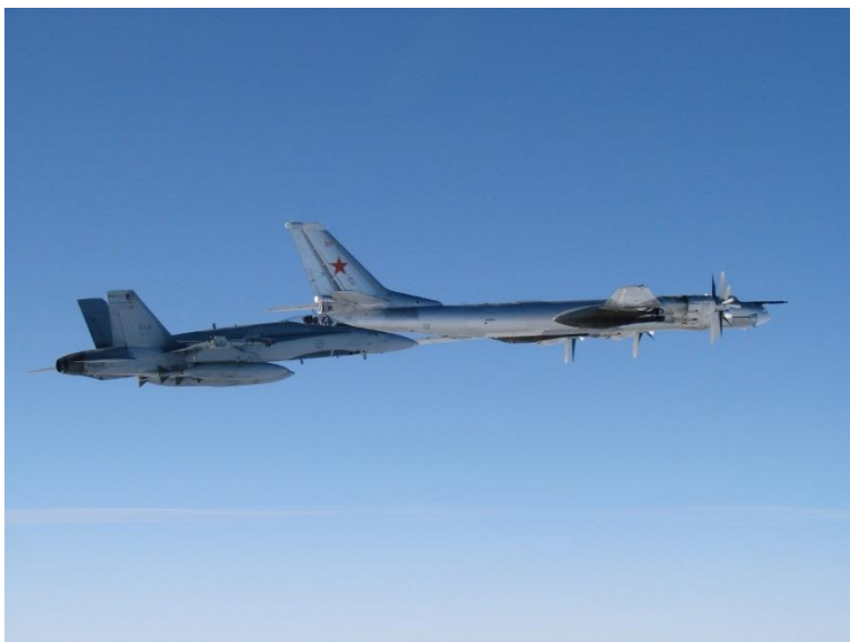
Figure 2: A CF-18 Hornet fighter intercepting a Tu-95 bomber near the Canadian Arctic coastline.