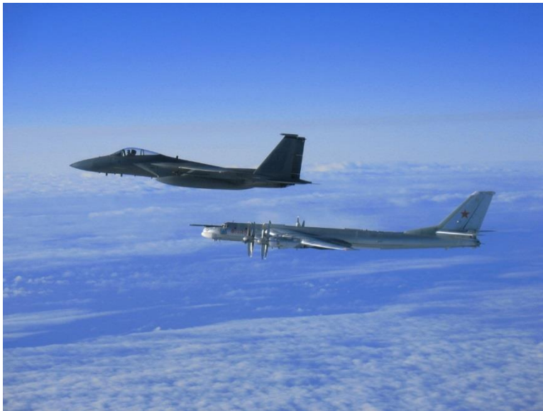
Figure 1: An F-15 Eagle fighter intercepting a Tu-95 bomber near Alaska.