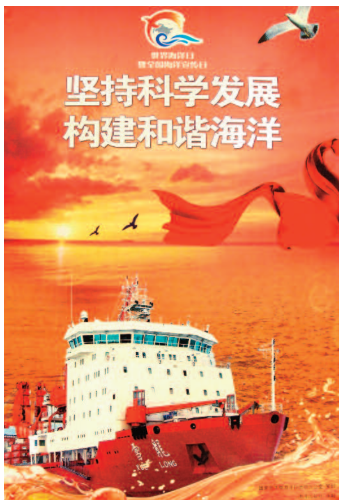
Picture 1: The poster for World Ocean Day shows the Chinese icebreaker Xuelong, State Oceanic Administration, Beijing, 10 December 2012.