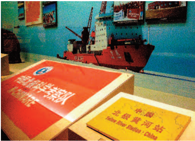
Picture 2: China's Arctic Exploration display, National Museum of China, Beijing, 14 December 2012.