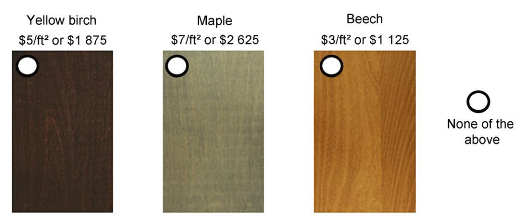
Fig. 1. Example of a choice task in the questionnaire that named the species

representative of a buying situation where the customer has the option of not buying what is available. To illustrate the products, pictures were included in the questionnaire (Fig. 1). In the face-to-face survey, wood samples were made physically available to the respondents. Prior to the choice tasks, six socio-demographic questions were asked to describe the samples by gender, age, income, house property status, and their real-life flooring purchase situation. Also, two questionnaires were developed, one including and one not including a presentation of the species names.