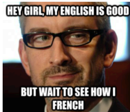
Figure 1. Meme Featuring Jean-Martin Aussant, the 2012 Option Nationale Leader.