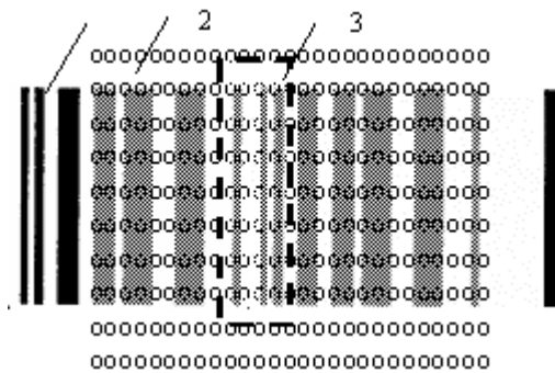
Fig 2. Array of photosensors and bars of meter on it: 1 – coded bars of meter, 2 – array of CCD sensors, 3 – analysing window

r – correlation coefficient; m and n – numbers of rows and columns; A_{ij} – digital number from subarray A in the row i and in the column j ; \bar{A} – average of all digital numbers in subarray A , and \bar{B} – average of all digital numbers in subarray B . i = 0, 1, 2, 3, \dots, m ; j = 0, 1, 2, 3, \dots, n .