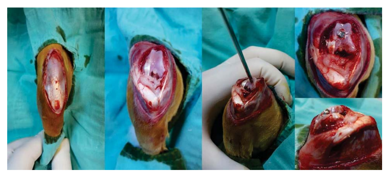
Figure 1. Incision, patellar tilt, entrance point of the implant sent for fixation into the femur and its appearance in the intramedullary canal

10 weeks after the second operation radiographic union was observed. All animals were euthanatized by decapitation. The femurs with the implants were disarticulated from the knee and hip joints. All soft tissue was