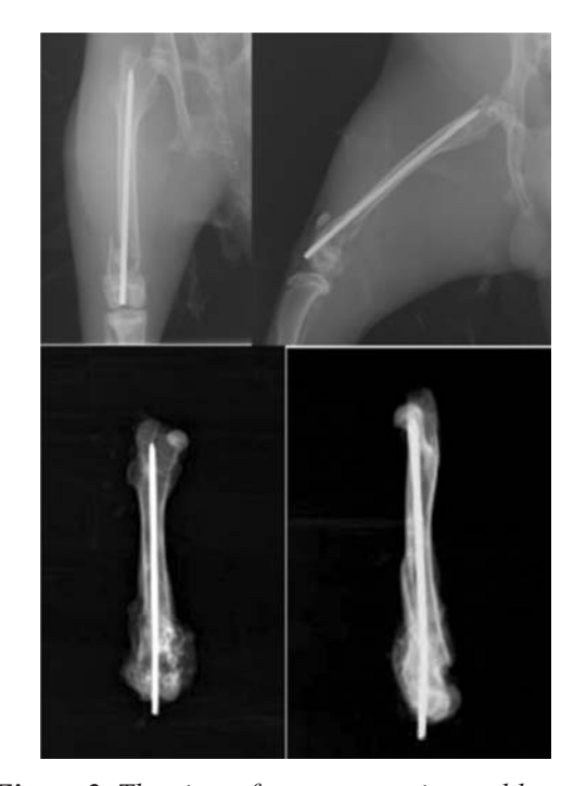
Figure 2. The view of anteroposterior and lateral radiographs of closed fractures that were created by standard methods and the view of bone union after 10 weeks

In the histological evaluations, a large amount of connective tissue and newly formed capillary vessels