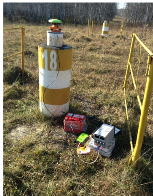
Figure 3. Base station BI18 of O. P. Suchkov SSB with GNSS equipment placed upon it