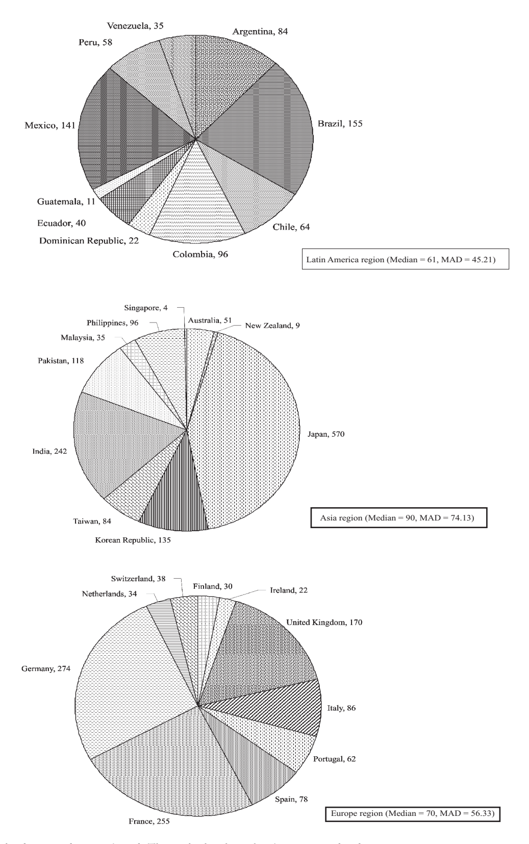
Figure 1. Selected regions and countries for study. The pies also show the number of universities and academic institutions per country in every region. The median and median absolute deviation (MAD) per region are presented.